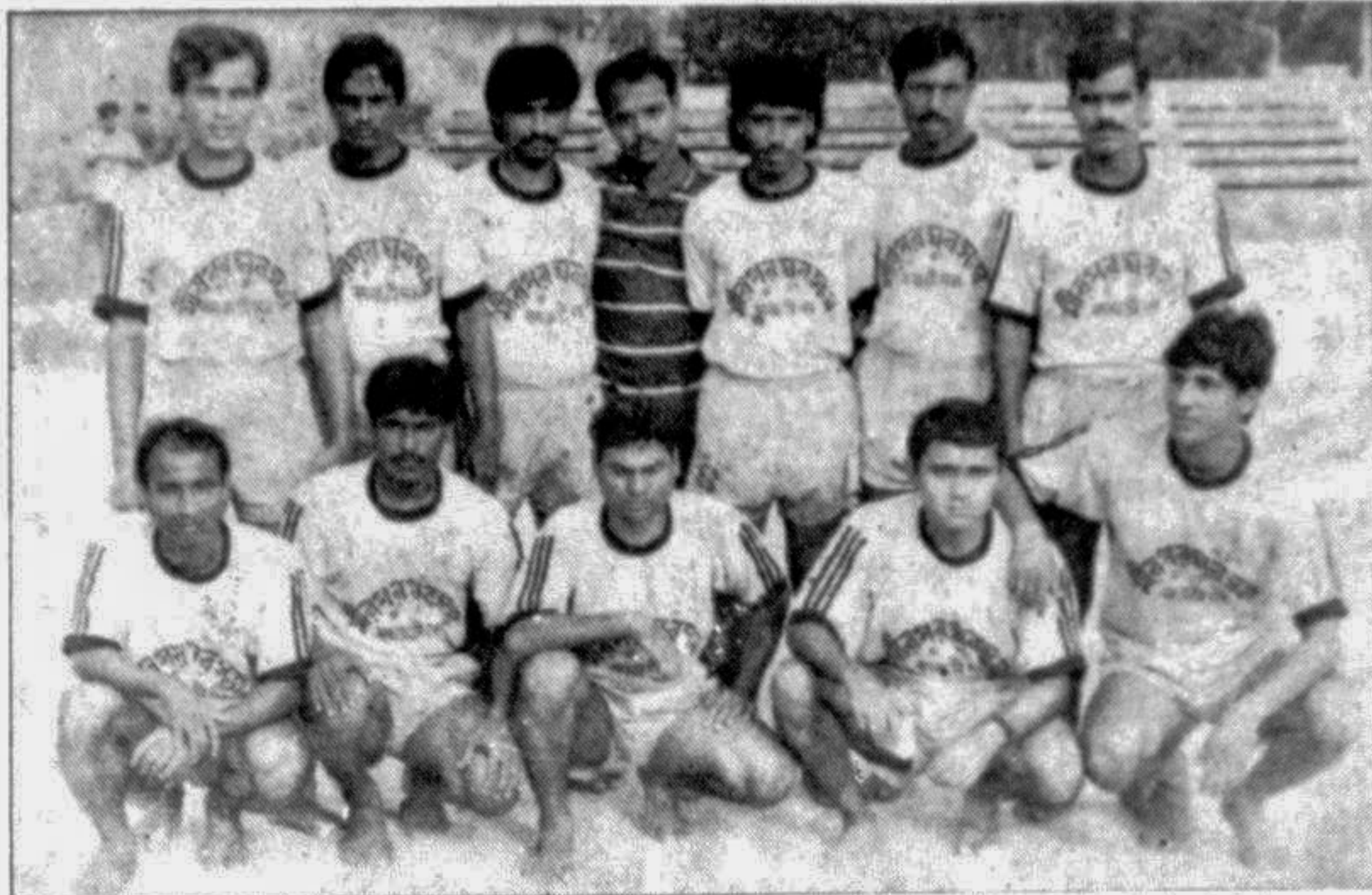
The players and an official of Mirpur Juba Sangha who won the Metropolis kabaddi league title for the third time in a row beating Azad Sporting Club in the final at the Outer Stadium court yesterday.

Sports Reporter Mirpur Juba Sangha clinched the Metropolis kabaddi league title for the third time on a trot when they beat Azad Sporting Club by a hefty margin of 44 points to nine in a lop-sided final at the Outer Stadium court yesterday.