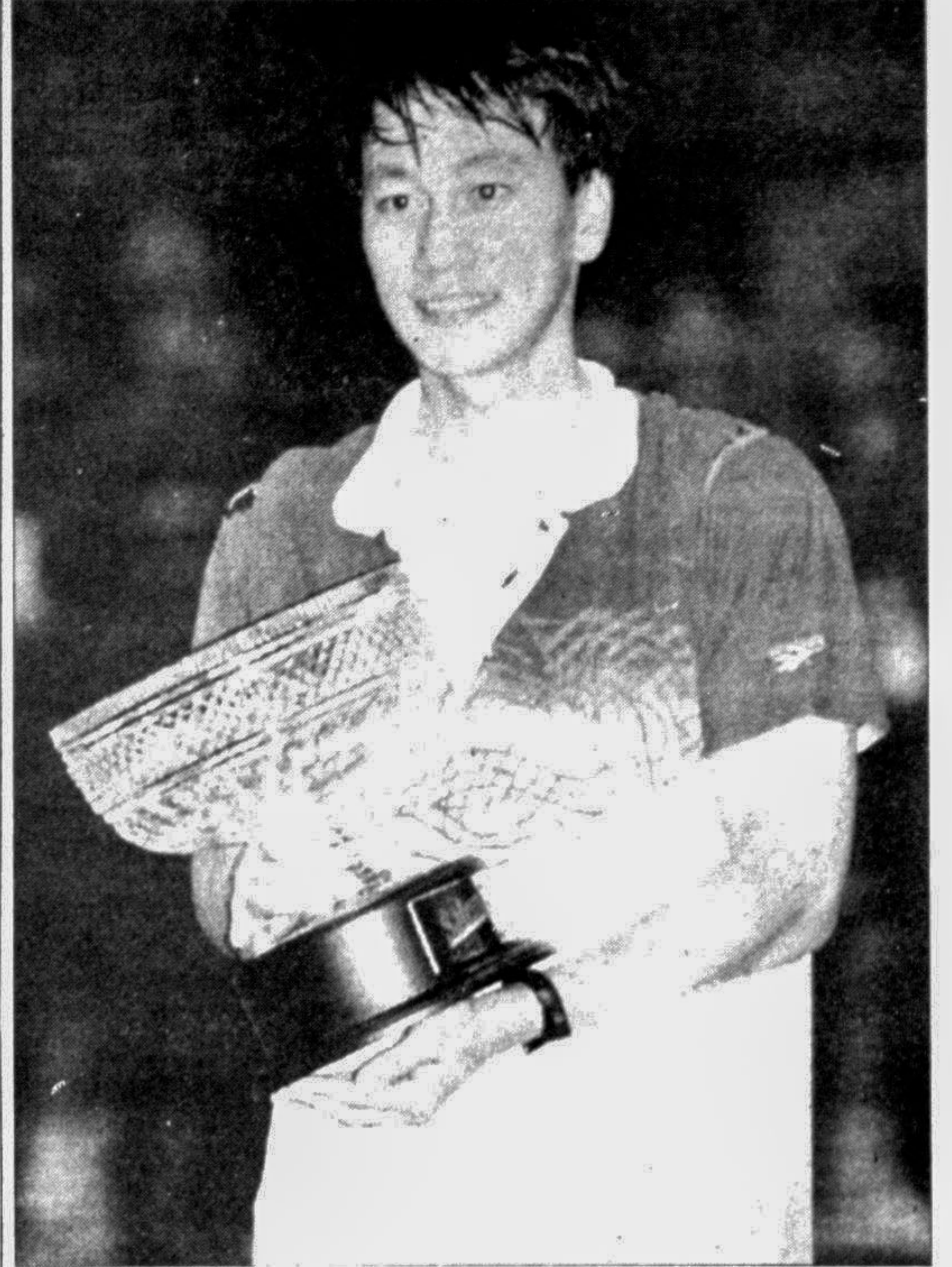
American Michael Chang poses with the Malaysian Open tennis trophy after beating Jonas Svensson 6-0, 6-4 in the final at the Malaysian capital of Kuala Lumpur yesterday.

Dalimiya said India may play in Sharjah next year after receiving assurances from the CBFS that the tournaments will be conducted 'impartially'.