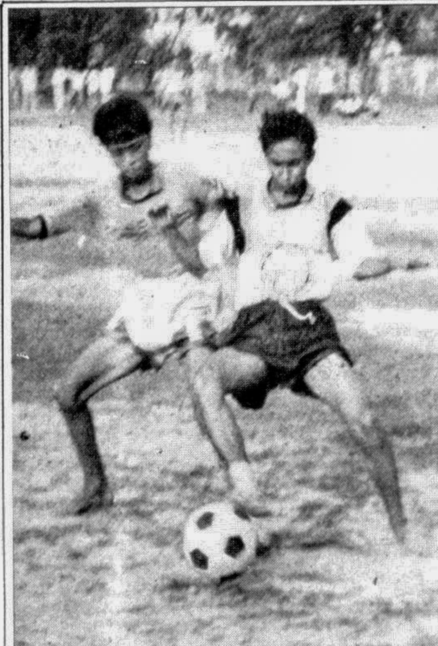
Action from yesterday's Shah Sports Cup juvenile soccer tournament match between Dhaka Football Coaching Centre and Chandnight Tarun Sangha at the Outer Stadium. Dhaka Football Coaching Centre won the match by three goals to nil.

Peter Reid, the former Manchester City player-manager, made his debut for the Saints who remain just a point above Swindon in 21st place.