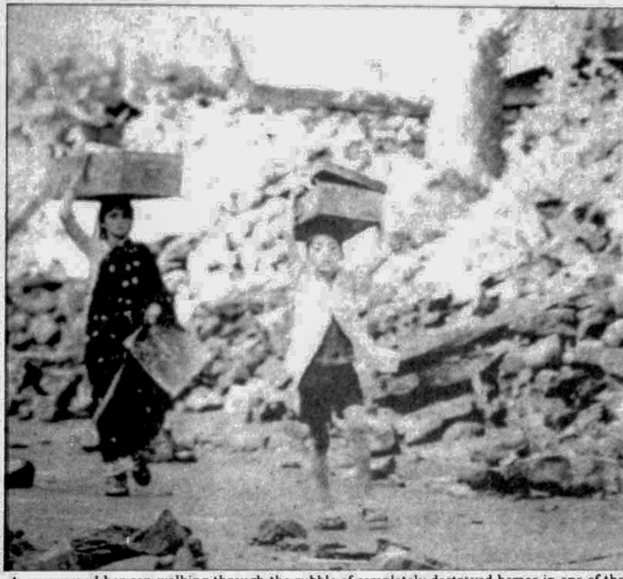
A woman and her son walking through the rubble of completely destroyed homes in one of the worst-hit villages, a day after a powerful earthquake devastated a vast area in Maharashtra, India.

LONDON, Oct 2: Police searched for clues amid the wreckage left by three bombs that rocked northwest London early Saturday frightening late-night pedestrians and showering them with glass, reports AP. Six people were wounded by shards of flying glass and treated at a hospital, police said. There was no immediate claim of responsibility for the attack.