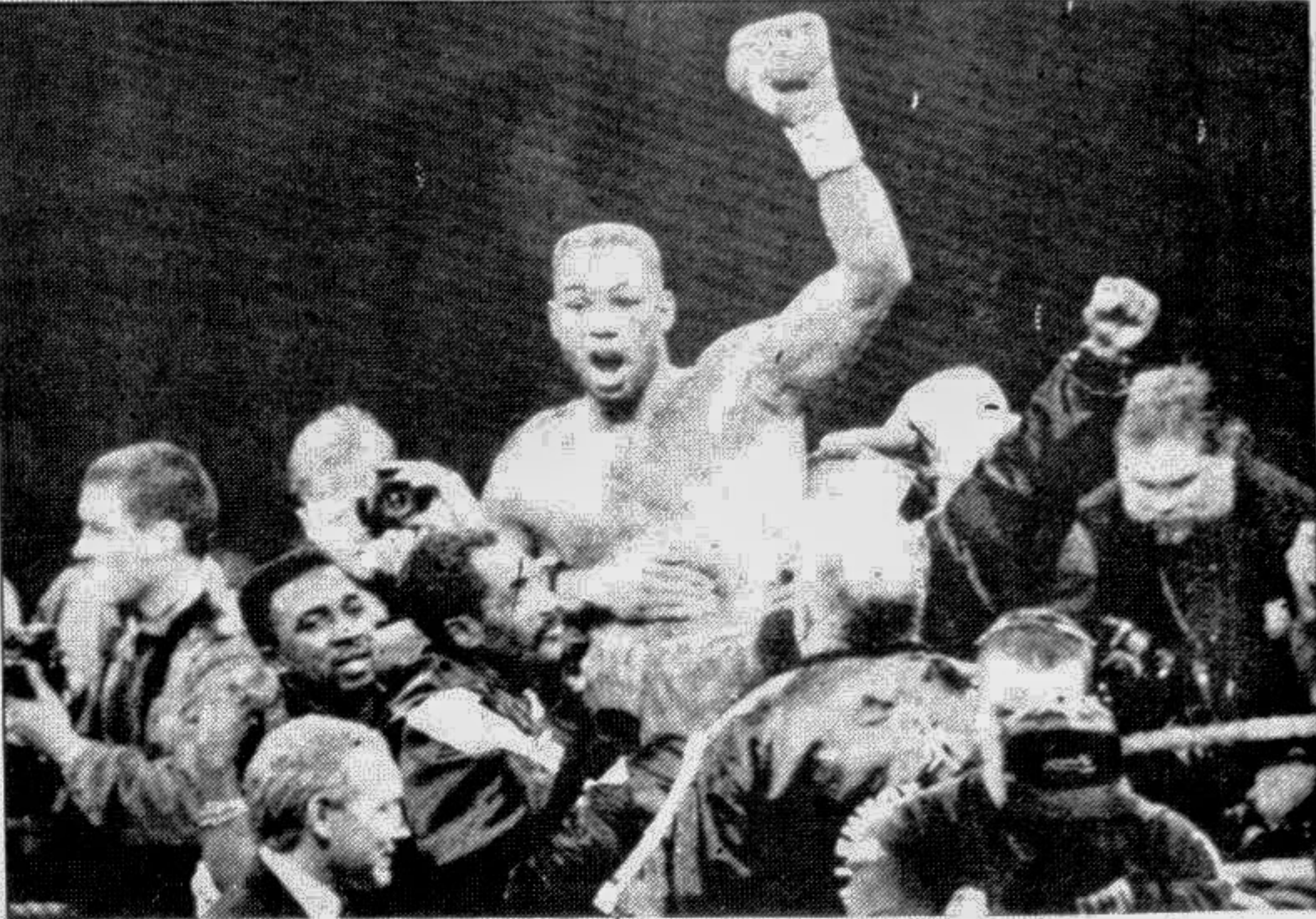
World Boxing Council (WBC) champion Lennox Lewis celebrates after stopping fellow-Briton Frank Bruno in the 7th round of their title bout in Cardiff early yesterday. It was Lewis' second successful title defence.

The other sixteen players, referee and two line-men suffered from shock in the incident Thursday evening in Sungkai, 250 kilometres (150 miles) north of the capital, the Star and other dailies reported.