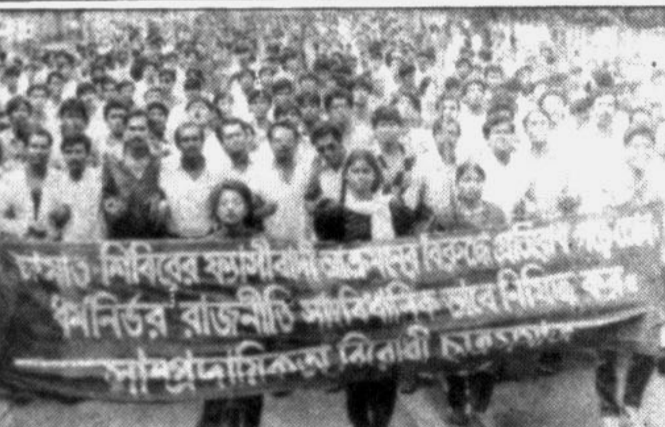
The newly-formed anti-Communist Students' Front brought out a procession with lathis (sticks) in the city yesterday demanding a ban on the religion-based politics of the Jamaat-Shibir.

The government has decided to appoint Brigadier Chowdhury Khalequzzaman (Retd) as Ambassador of Bangladesh to the Union of Myanmar, reports BSS.