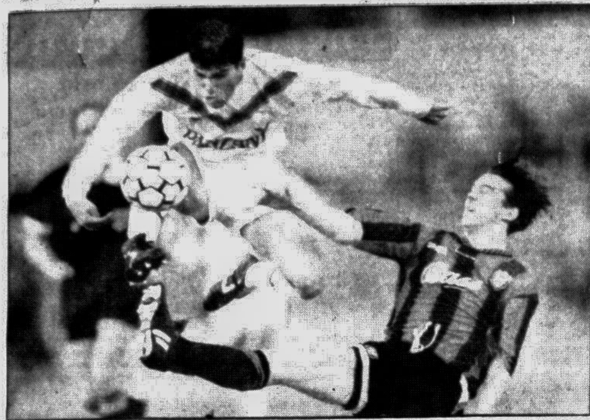
Bordeaux' Zinane fights for the ball with Dublin's Moody during their UEFA soccer match in Bordeaux, France on Sept 28. Bordeaux won 5-0.