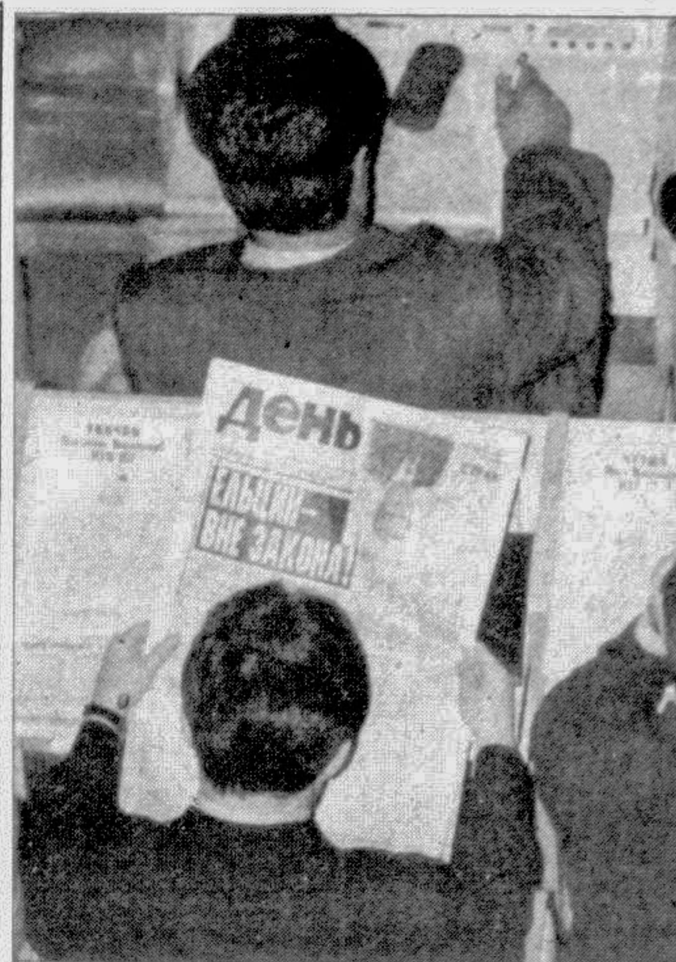
MOSCOW: A deputy reads a Russian newspaper that published a picture of President Boris Yeltsin up-side-down and the headline 'Yeltsin out of law', during the opening of the second day of the Congress of Russian People's Deputies yesterday. The 10th Congress was called after the president dissolved parliament.

The high-level talks were made possible by Iraq's agreement on Thursday to activate UN monitoring cameras at two rocket test sites.