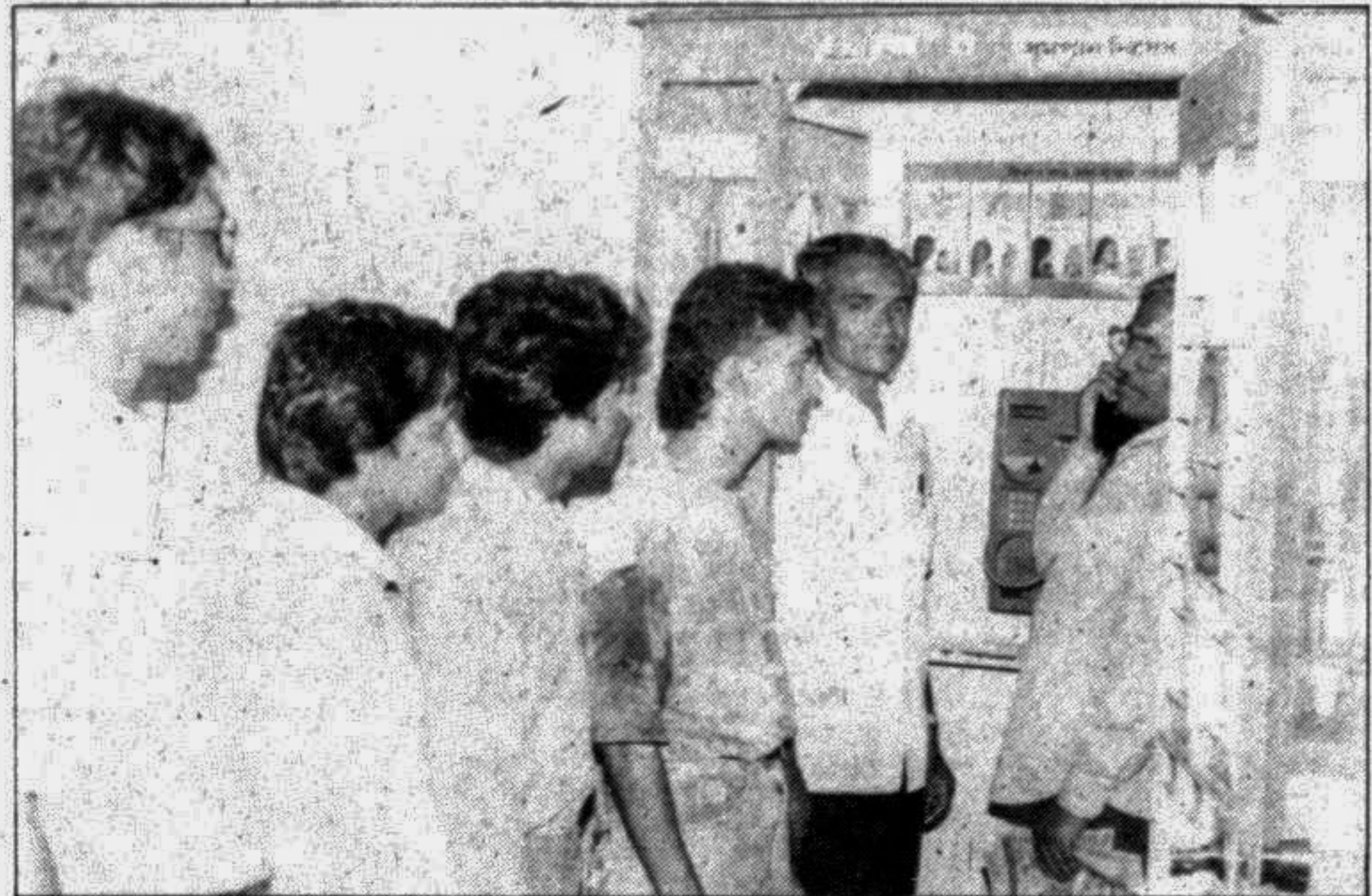
The latest technological convenience in town.

Making a call from a public phone booth used to be a nightmare. Remember the times you desperately rummaged through pockets or purses to find the twenty-five paisa coins that have almost become extinct from our everyday lives — even for the beggars on the street? Recall the occasions when even after bribing the phone with endless coins or banging it with your fists, it stubbornly refused to give you that longed-for sound of the dial tone? Those unhappy days are finally over, thanks to the latest convenience provided by the T & T board, the 'card phone'.