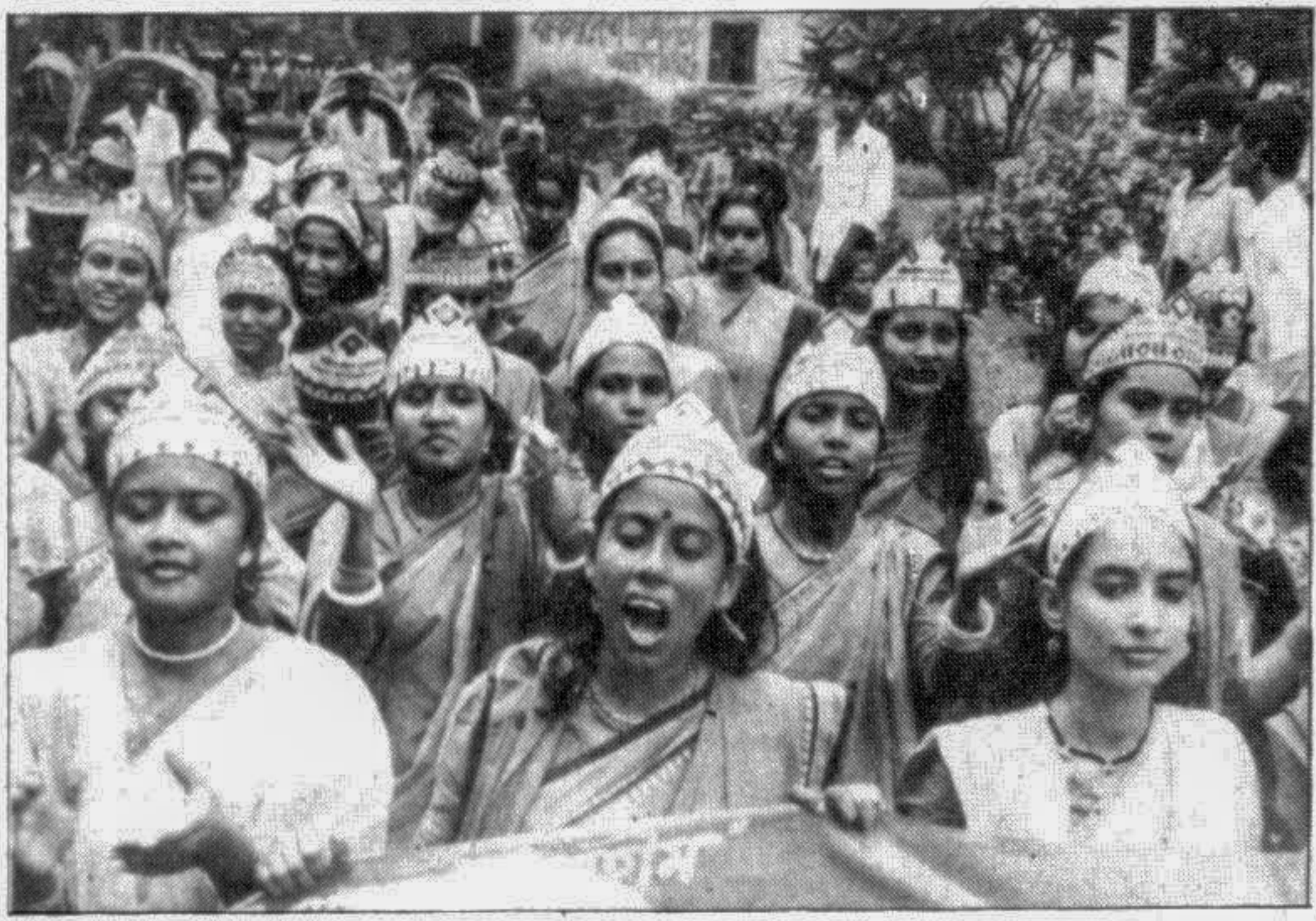
Kuwait Maitri Hall unit of the Jatiyatabadi Chhatra Dal brought out a colourful procession on the DU campus to mark their freshers' reception today.

DFF (BA) 8564-21/9 Biman G-1254 100, Motiheel C/A, Dhaka