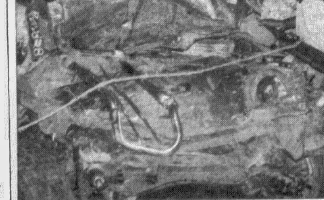
The mangled remains of the Pajero jeep which met with an accident near the Shanir Akhra in Demra, killing three of its occupants yesterday.

"Islam is a religion of peace and what the Jamaat practices is definitely not Islam," the