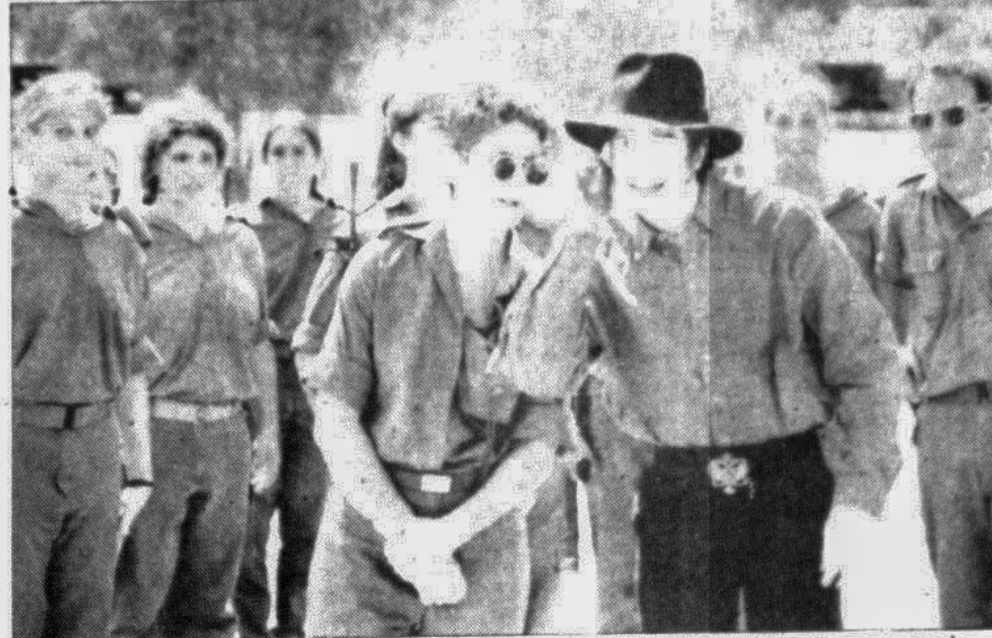
Pop star Michael Jackson listening to a female Israeli officer during his visit to an army base near Tel Aviv yesterday shortly before his departure for Turkey

CHITTAGONG, Sept 22: The first day of the indefinite strike in Chittagong University, enforced by Jatiyatabadi Chhatra Dal (JCD) and Awami League-backed Chhatra League, passed off peacefully today, reports UNB.