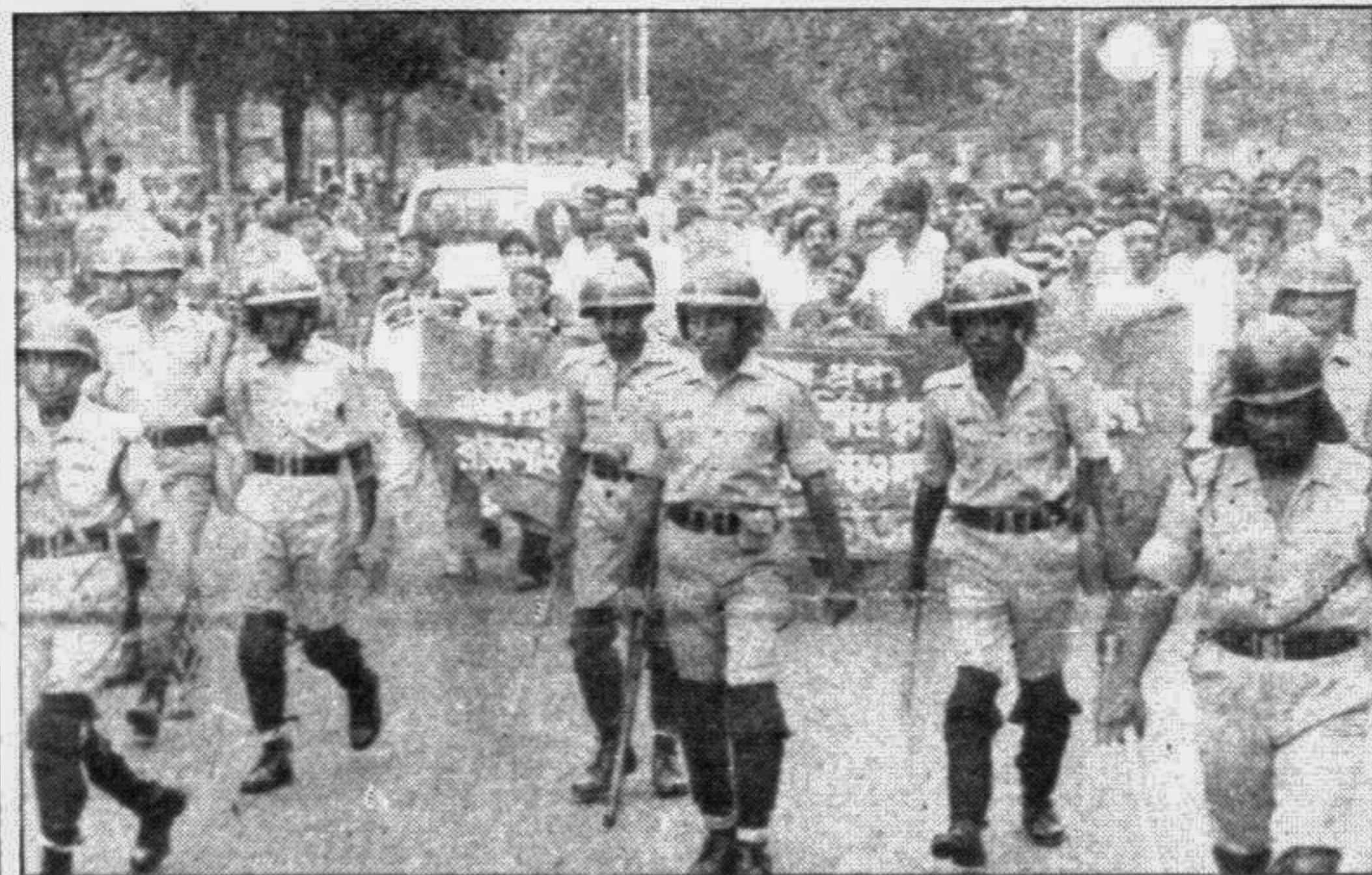
An anti-Shibir rally of the Dhaka University students near the TSC in the city, marching under police escort yesterday.