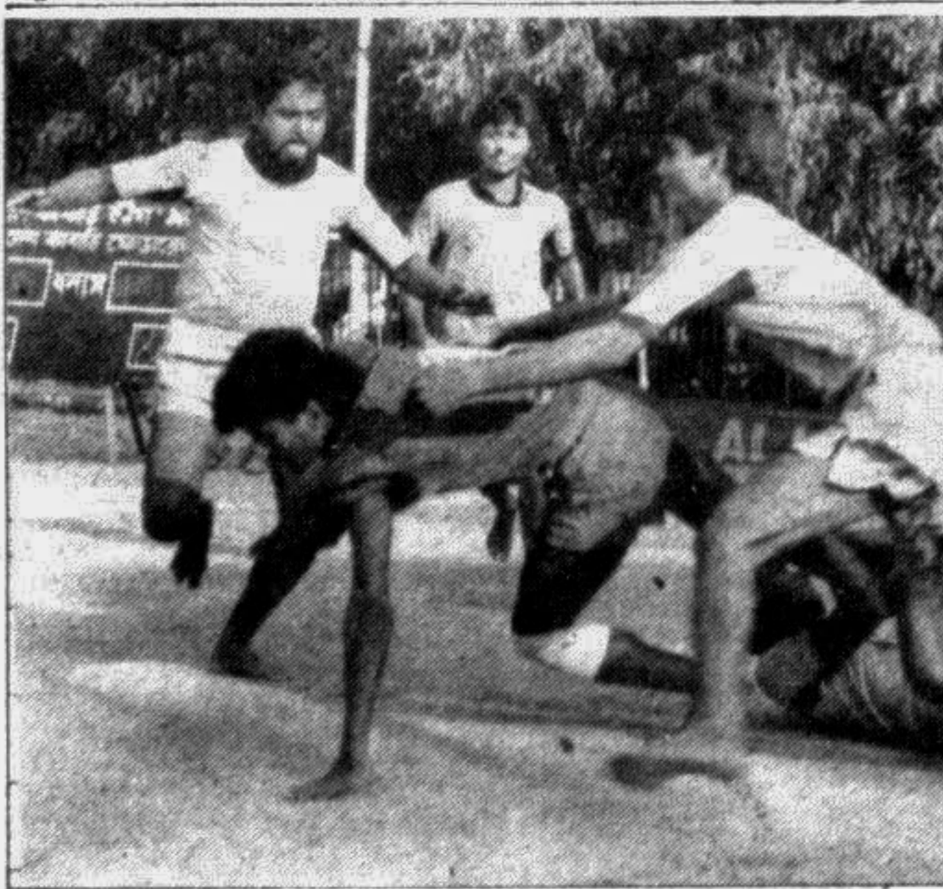
Action from yesterday's Metropolitan kabaddi league match between Jurain Janata Club and Bangladesh Boys at the Outer Stadium court. Jurain Janata recorded a hefty 56-7 victory.

Only goal difference keeps Southampton above newcomers Swindon at the foot of the table. Both have three points.