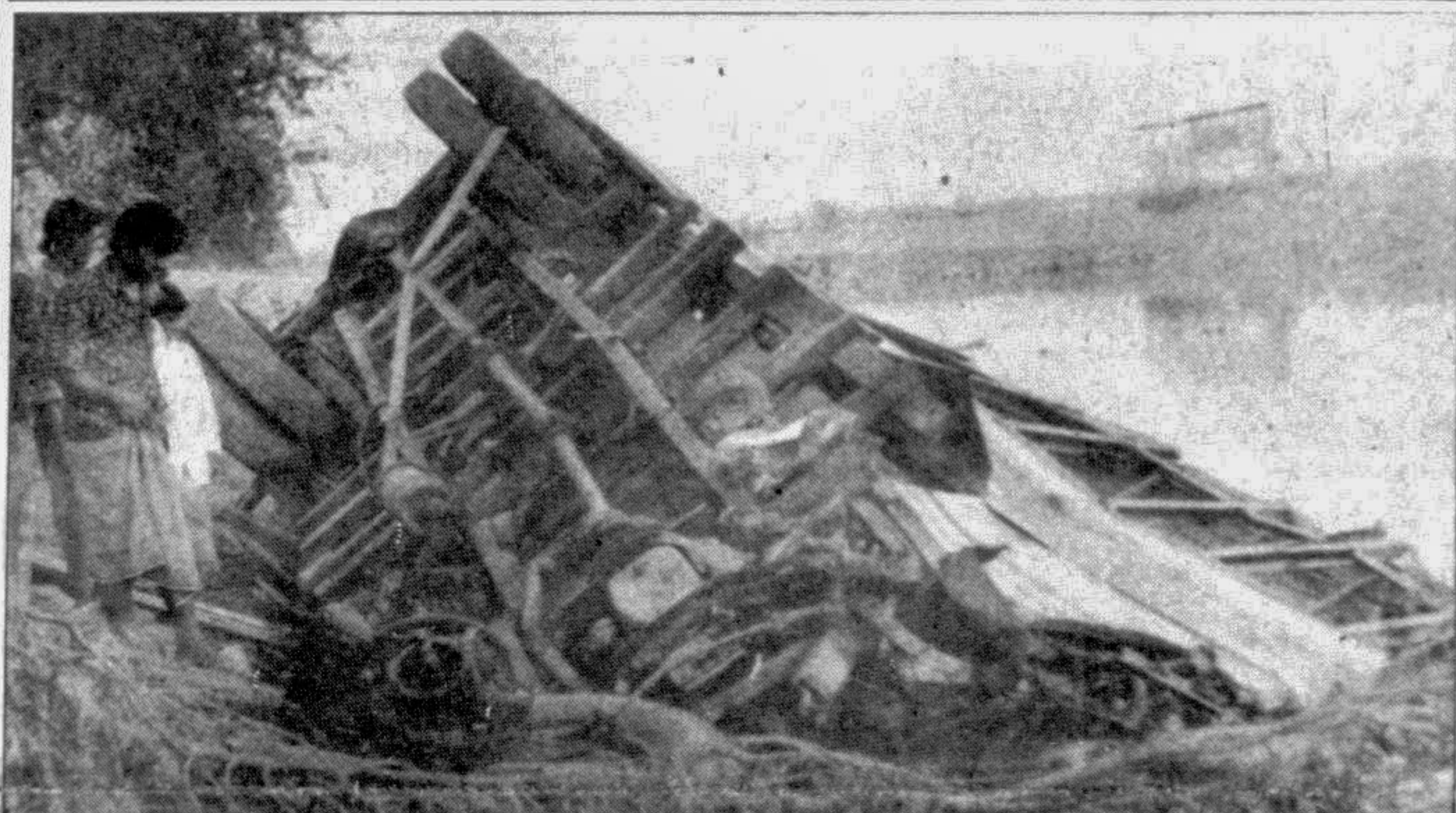
A Dhaka-bound passenger-bus from Narsingdi fell into a roadside ditch yesterday, killing four passengers.