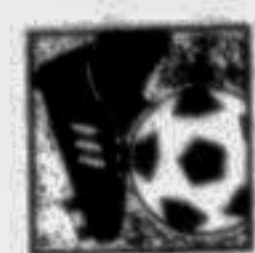
Abahani Kirta Chakra exacted a sweet revenge and confirmed at least the runners-up position in this year's Star Premier Division football league