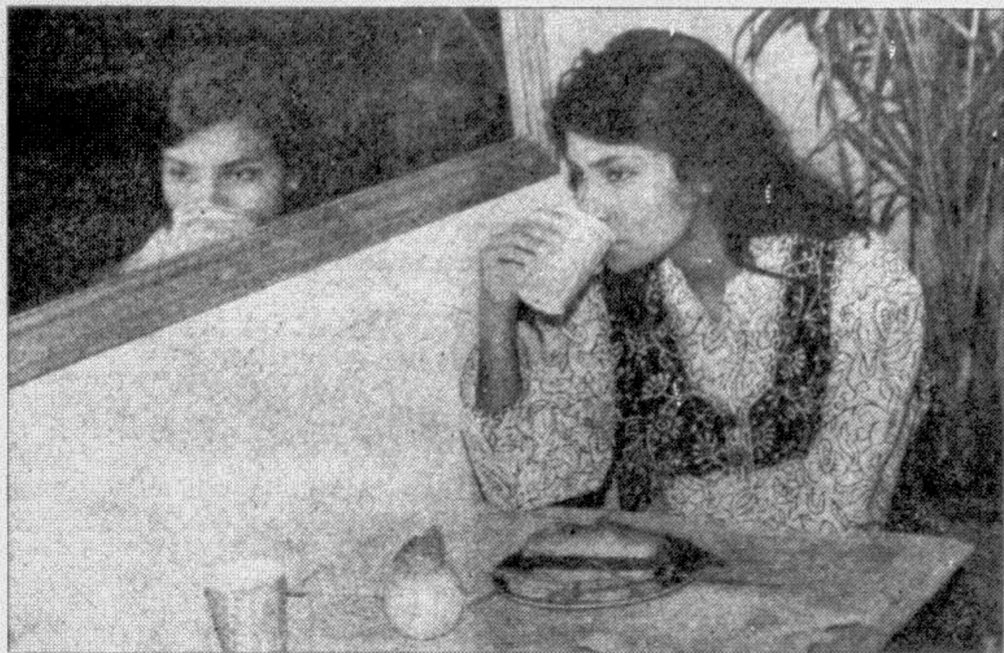
Inside Latimi, one of the fast-food centres, leisurely eating adds to its speciality.

Hungry? No problem, just look around you and go to the nearest fast food joint. Fast food shops have sprung up all over the city, adding a new trend to city life.