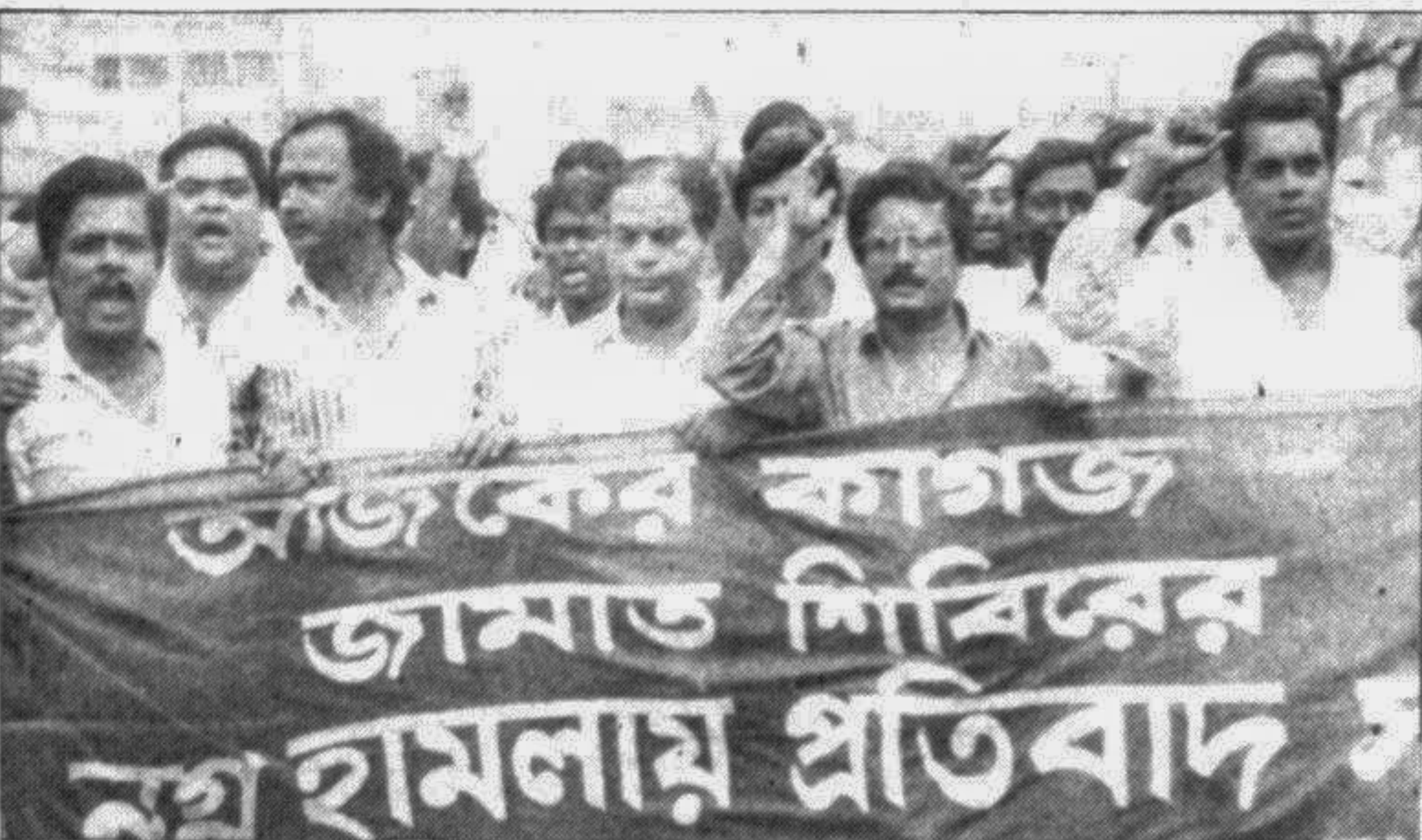
Journalists and employees of the daily 'Ajker Kagoj' brought out a procession in the city yesterday protesting the Friday's bomb attack on their office.