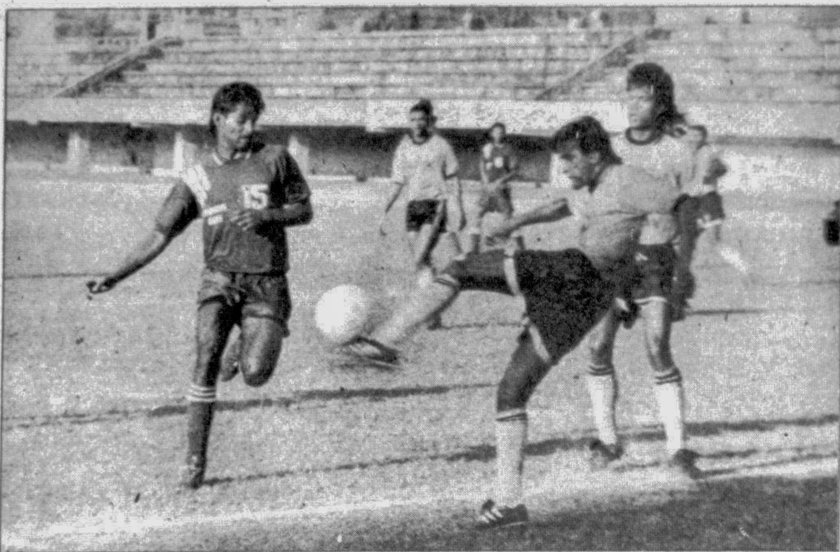
Action from yesterday's Star First Division football league match between Dhanmondi Club and East End Club at the Hockey Stadium. Dhanmondi recorded an emphatic 3-1 victory.