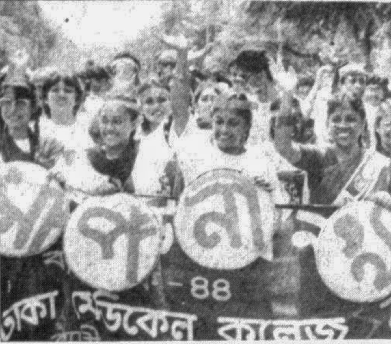
The '93 batch of the Dhaka Medical College Hospital (DMCH) brought out a colourful procession on completion of their course in the city yesterday.

His bank account No is: SB: 11950/51, Dhaka Old Airport Branch, the Sonali Bank.