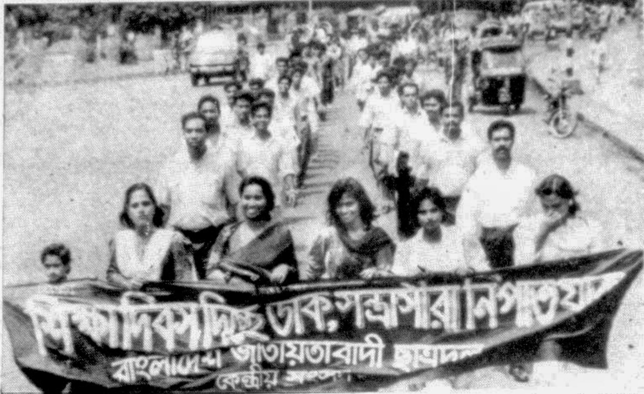
The central unit of Jatiyatabadi Chhatra Dal brought out a procession in the city yesterday to mark the Literacy Day.

India is an active member of the regional organisation for Asia and the Pacific.