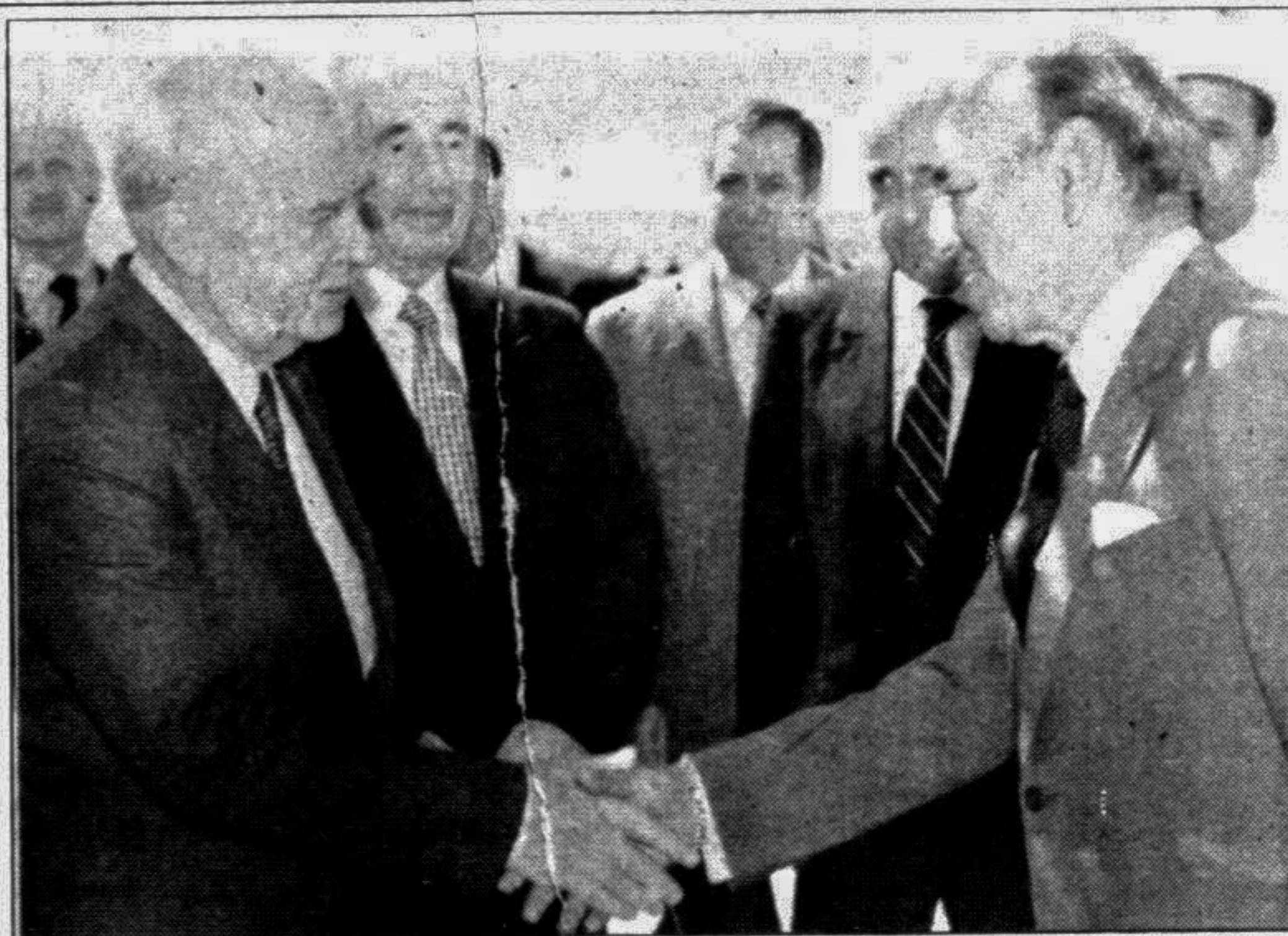
Israeli Prime Minister Yitzhak Rabin (L) and his Foreign Minister Shimon Peres (2nd L) are greeted by King Hassan II of Morocco upon their arrival in Rabat Tuesday.

The PPP leader, who served as Pakistan's first woman premier from 1988 to 1990, is seeking re-election from her Larkana home constituency in Sindh.