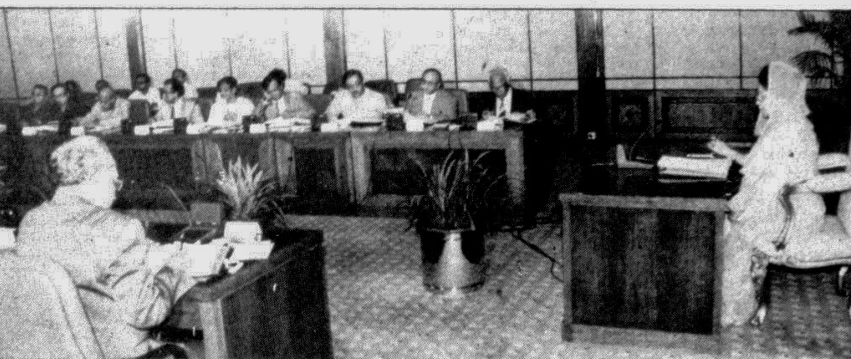
Prime Minister Begum Khaleda Zia presiding over a meeting of the National Implementation Committee of Administrative Reorganisation (NICAR) at the International Conference Centre yesterday.

The herbarium helps PhD and MS students for their thesis and research, people from Ayurved institutions regularly ask for help from the herbarium. It is an important institute but not properly recognised. So far depending on their documentation, a series of a books have been published: Flora of Bangladesh, Bulletin on Herbarium is also a publication on medicinal and economic important plants.