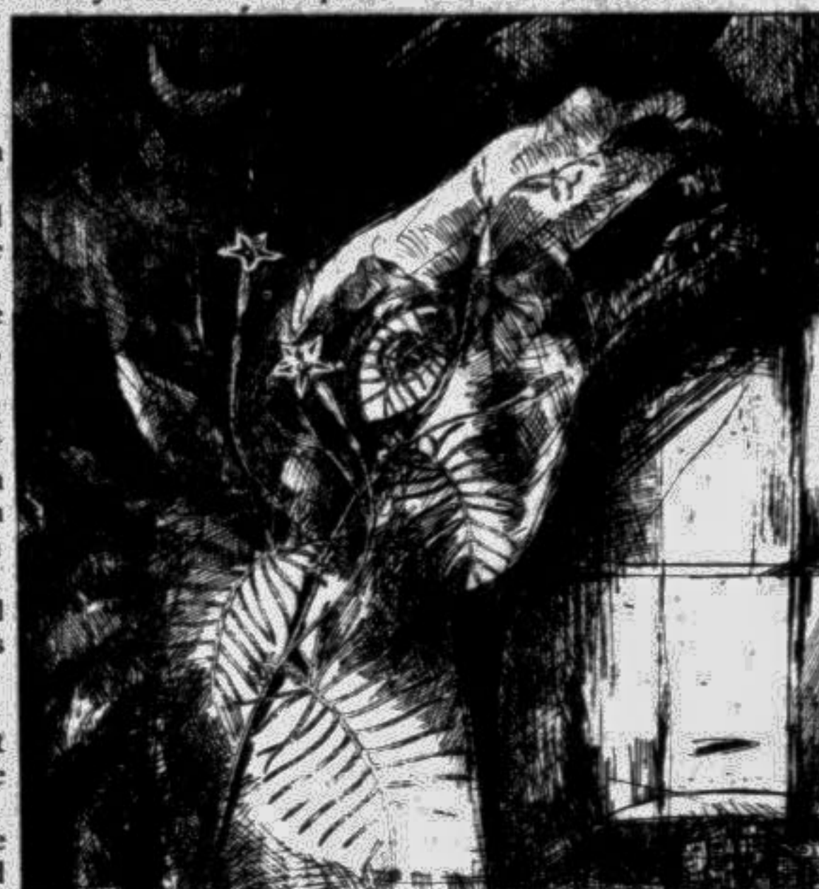
Biren Shome's beautiful painting based on herbarium specimen: Memory of 1971.

space constraints. These files are vital for future references and they are to remain for thousands of years. But if they are not properly maintained then the country might be deprived of valuable information about the endangered species. So far in a tropical country herbaria face a lot of problems. They can easily be attacked by insects or fungus because of humidity, the dried plants specimens can be destroyed if they are not properly dehumidified, and they must be kept in air-conditioned rooms.