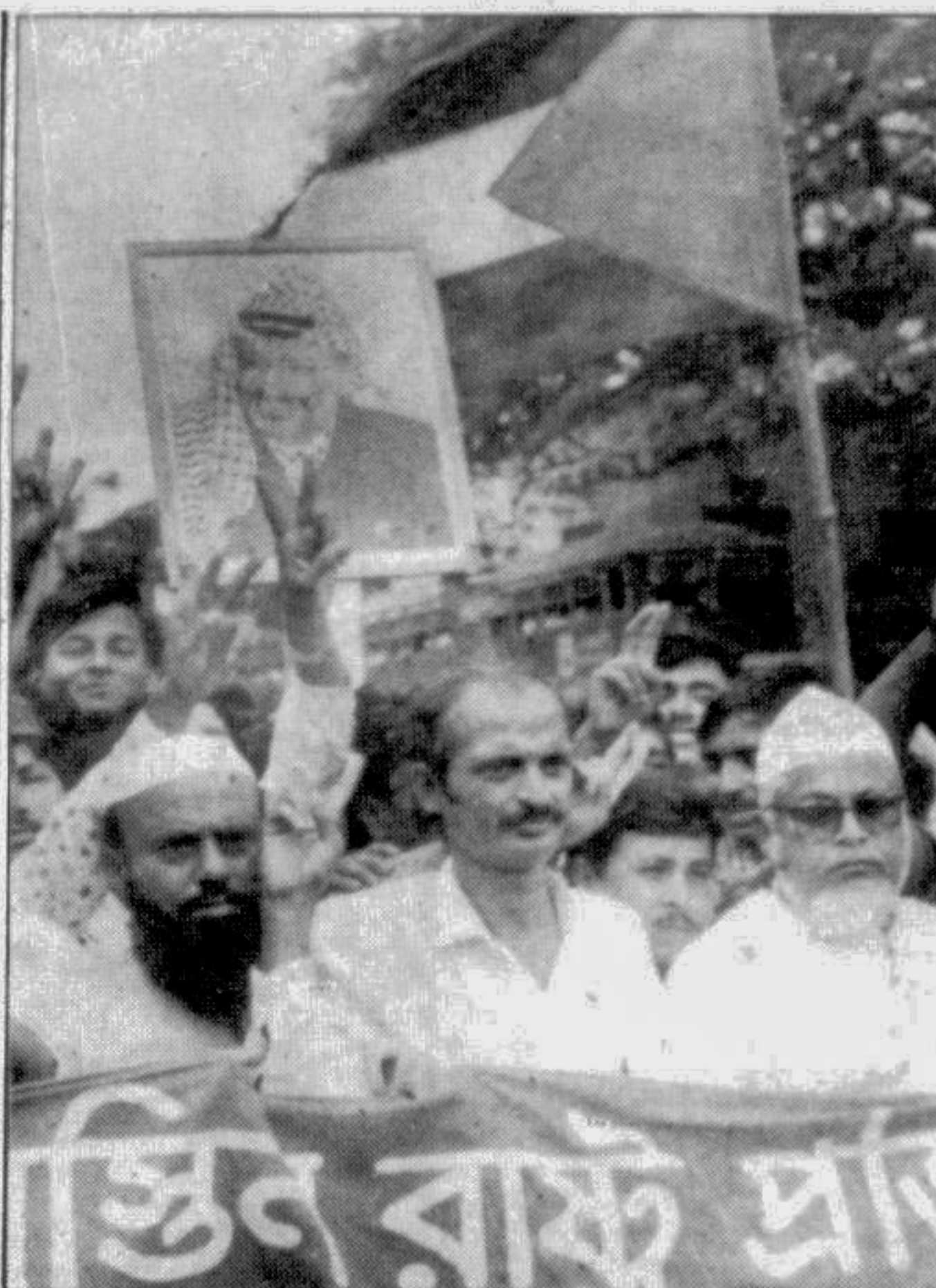
The Palestine Repatriated Muktijoddha Sangsad brought out a procession in the city celebrating the historic PLO-Israeli accord.

Wednesday 5:00 Opening announcement Al Quran Programme summary News in Bangla 5:10 News in Bangla 5:20 Recitation from the Geeta 5:25 Gillet World Sports Special 5:45 Banophool 6:50 Open University 7:20 Tagore Songs 8:00 News in Bangla 8:30 Ritter Taale Taale 9:05 Film: The A-Team 10:00 News in English 10:30 Pratashar Alo 11:30 Khabar/The News 11:40 Tomorrow's programme summary, closing announcement 11:45 Close down.