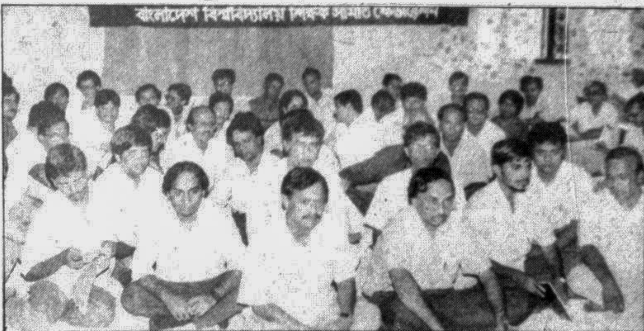
The Federation of Bangladesh University Teachers' Association (FBUTA) observed a token hunger strike at the Dhaka University Club yesterday.