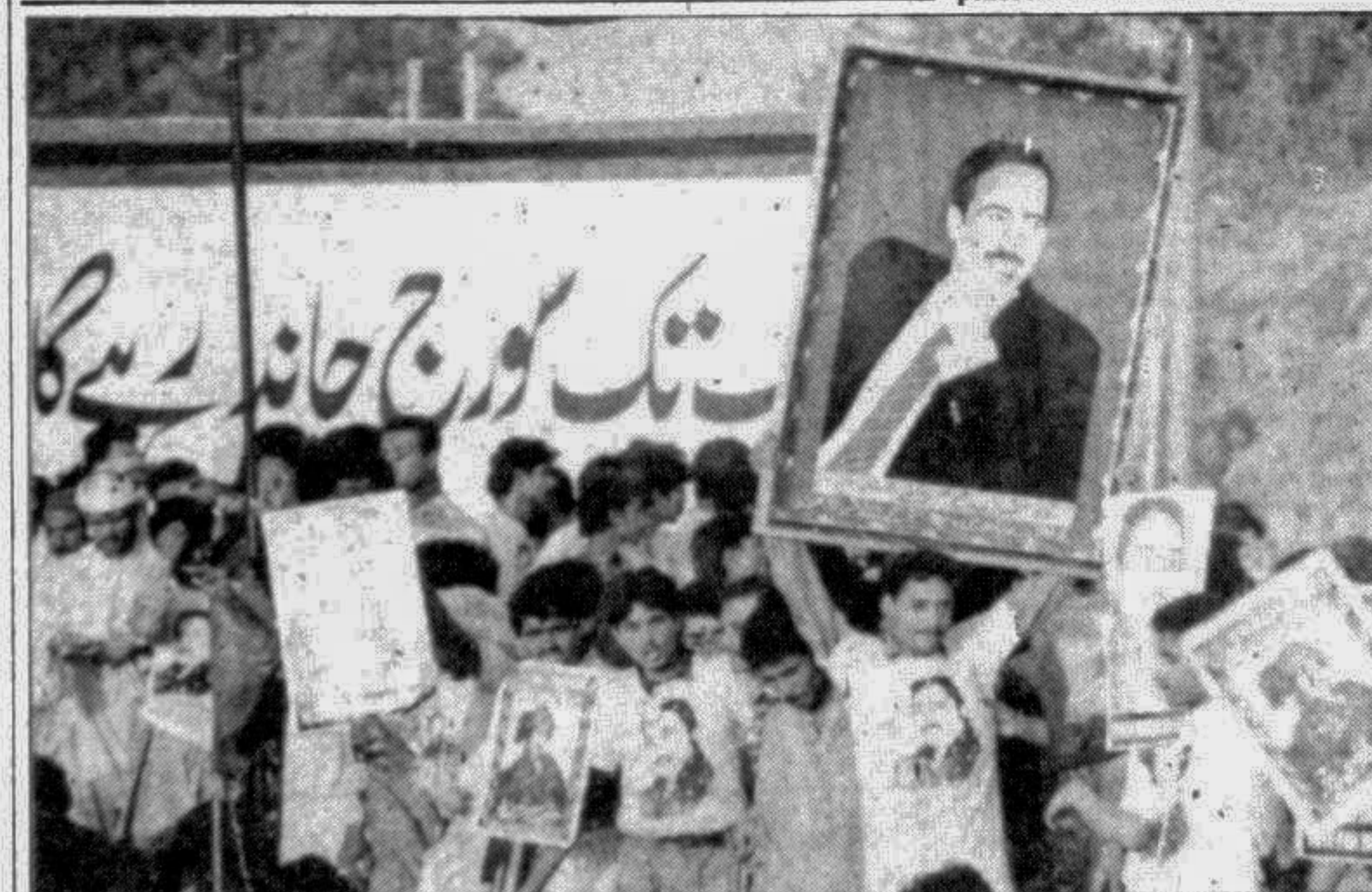
Youth from the rival wing of the Pakistan People's Party, carrying pictures of Murtaza Bhutto and chanting slogans in his favour, took over the stage where Benazir Bhutto was due to deliver an election speech in Karachi Friday.

"All these heinous acts were being done by using the local administration to belittle and defame me," he claimed.