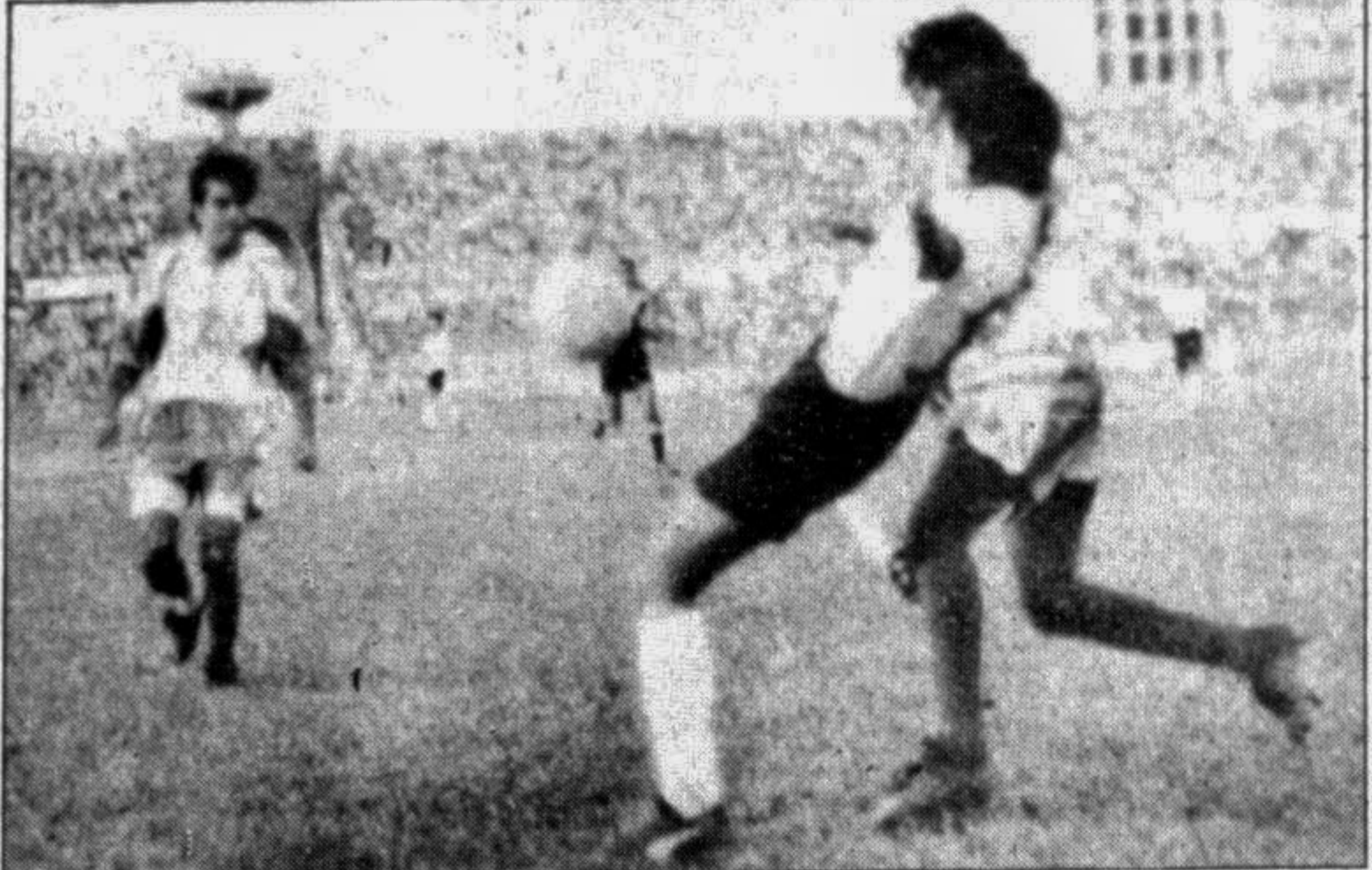
Action from yesterday's Star Premier Division football league match between Mohammedan Sporting Club and Arambagh Krira Sangstha at the Dhaka Stadium. Mohammedans maintained their all win record in the second phase of the ten-team tier with a comfortable 2-0 win.