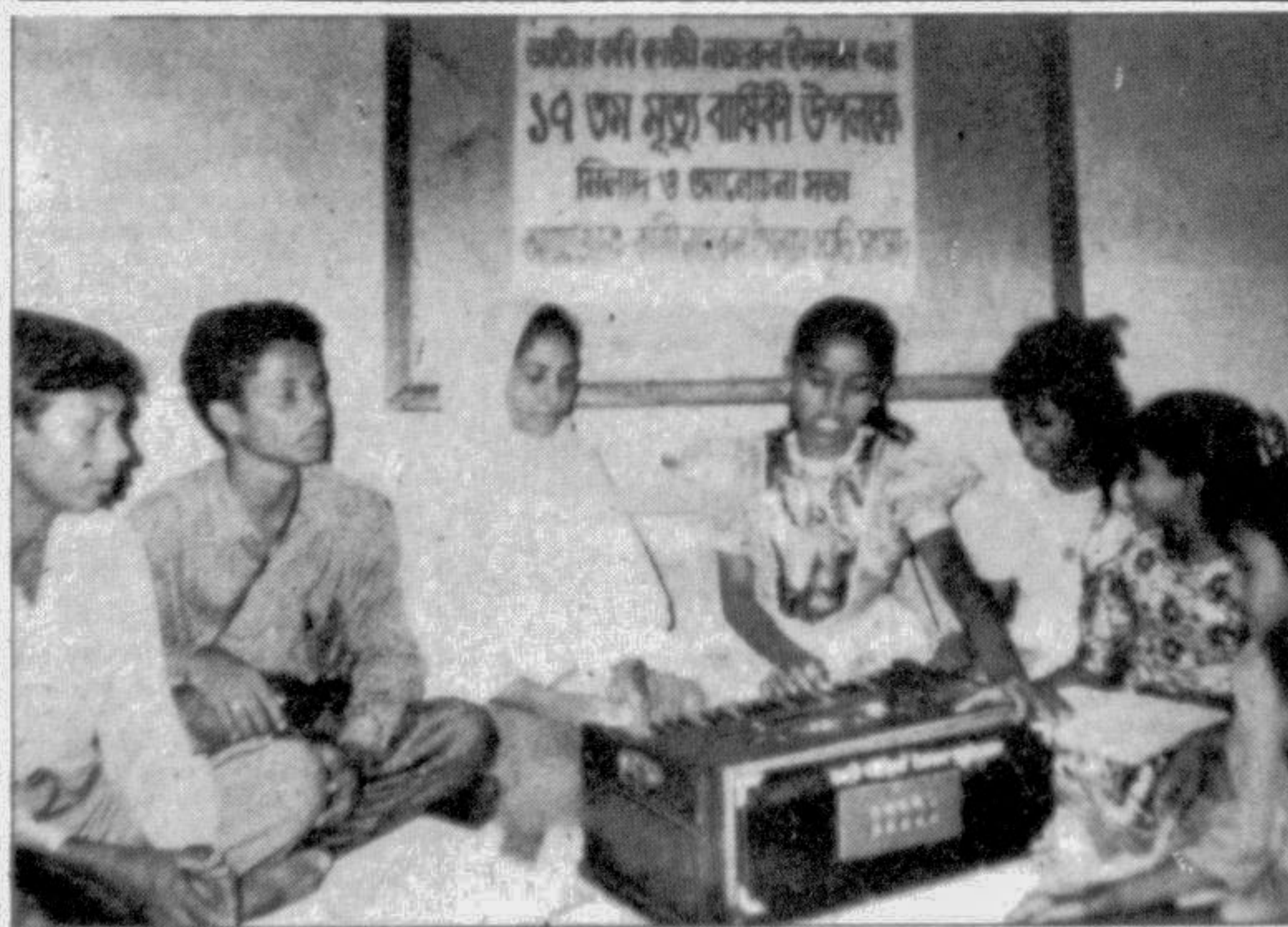
GAZIPUR: The local artistes are rendering songs at a function arranged here on the 17th death anniversary of national poet Kazi Nazrul Islam.

For implementing the programme successfully, the Forest Department has already disbursed saplings worth Taka one crore 12 lakh, the sources said.