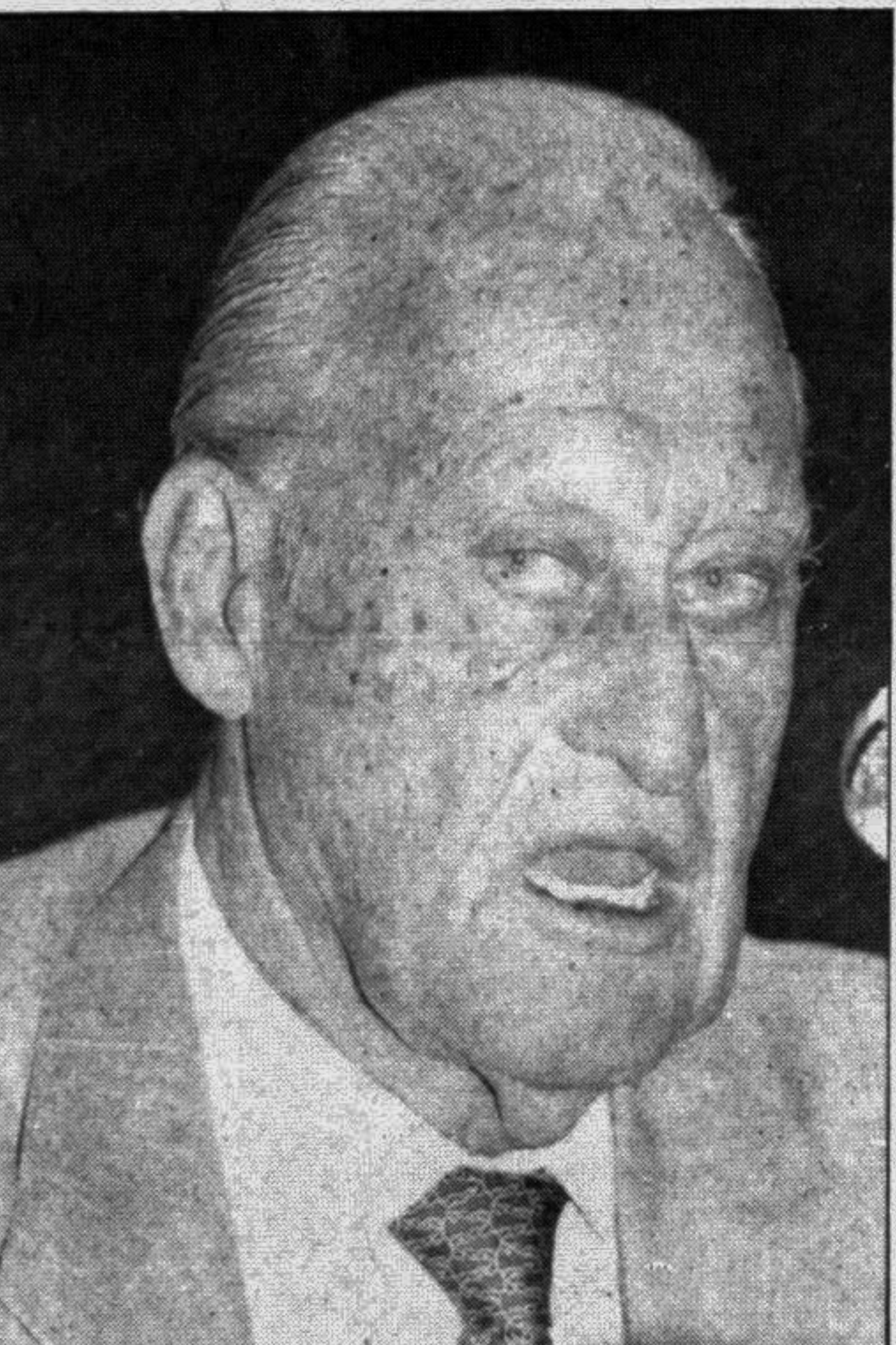
This picture dated June 9 shows FIFA president Joao Havelange addressing the media at a press conference in Paris. France will be suspended from all international competitions if Olympique de Marseille boss Bernard Tapie does not withdraw his legal proceedings against UEFA, football sources said yesterday. Havelange cabled the warning on September 8.

Trainer Gerard Houllier said: "If we beat Israel at home (on October 13), we will qualify. This would be the first time the French national team qualified before the last game."