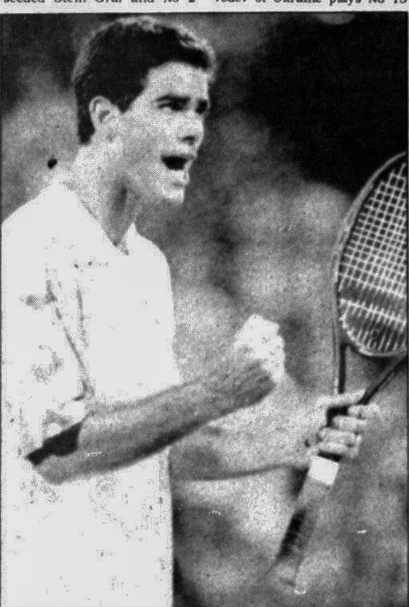
Wimbledon winner American Pete Sampras pumps his fist after breaking compatriot Michael Chang's serve in the US Open men's singles quarterfinal at the National Tennis Centre on Wednesday. Sampras squeezed past the seventh seed 6-7 (0-7), 7-6 (7-2), 6-1, 6-1 en route to the round of last four.

The men's semifinals were to be completed Thursday when eighth-seeded Alexander Medvedev of Ukraine plays No 15