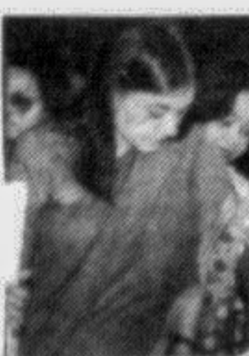
Old Traditions with a New Look Page 3