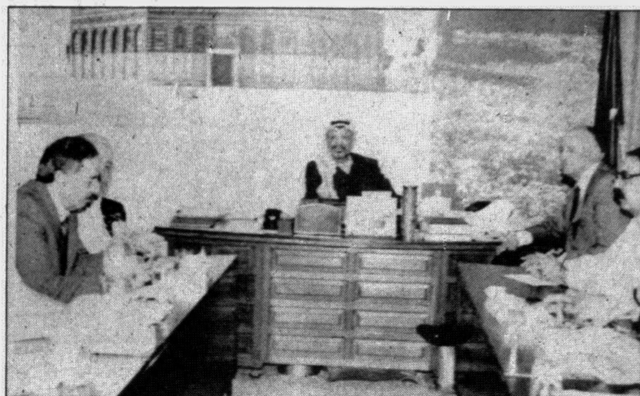
PLO Chairman Yasser Arafat (C) presiding over a session with the Palestine Liberation Organization's executive council members in Tunis Wednesday.

—Removal of clauses in the See Page 12 Col 3