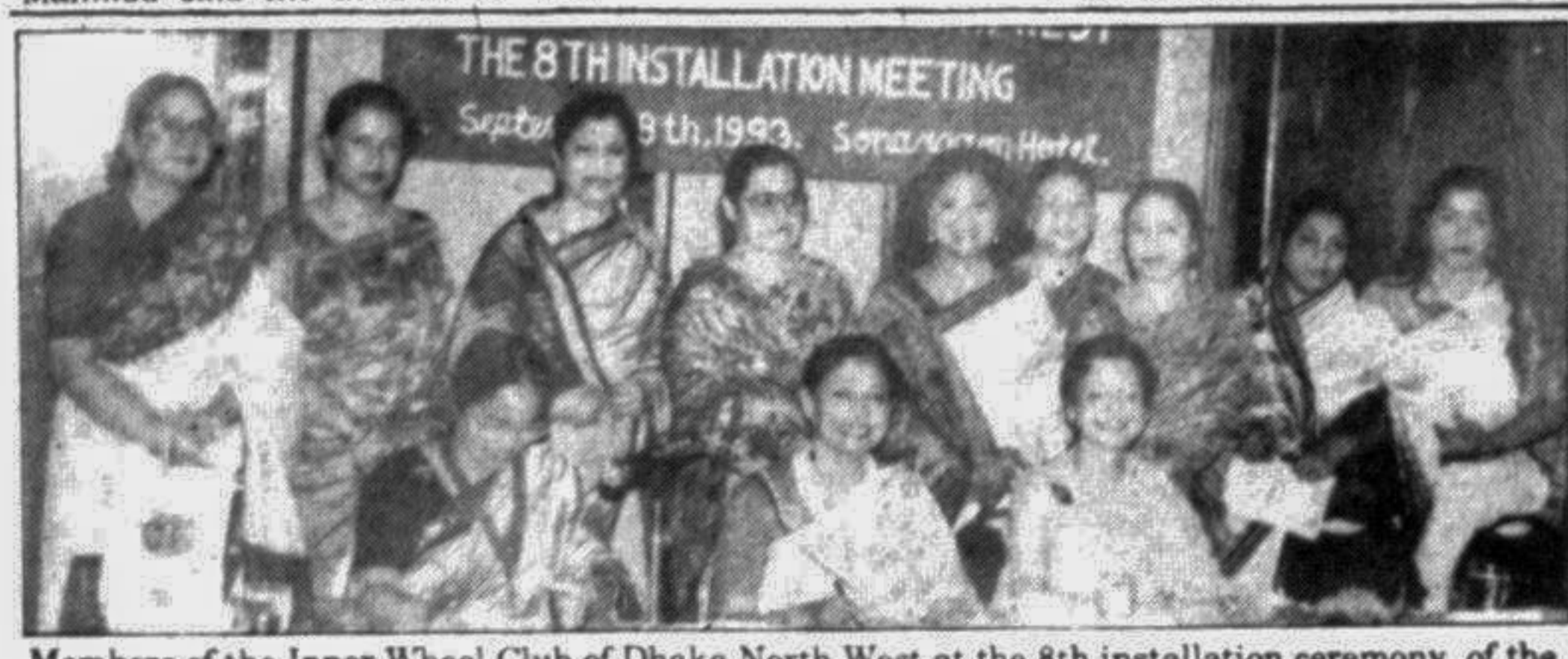
Members of the Inner Wheel Club of Dhaka North West at the 8th installation ceremony of the club at Sonargaon Hotel yesterday.