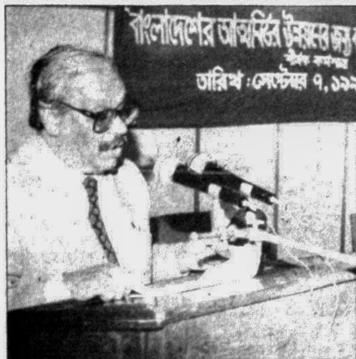
Planning Minister AM Zahiruddin Khan addressing a workshop of the Economic Association at the Family Planning Academy in the city yesterday.

The Energy Minister briefed the envoy on the initiatives of the present government towards the exploration of energy resources in the country.