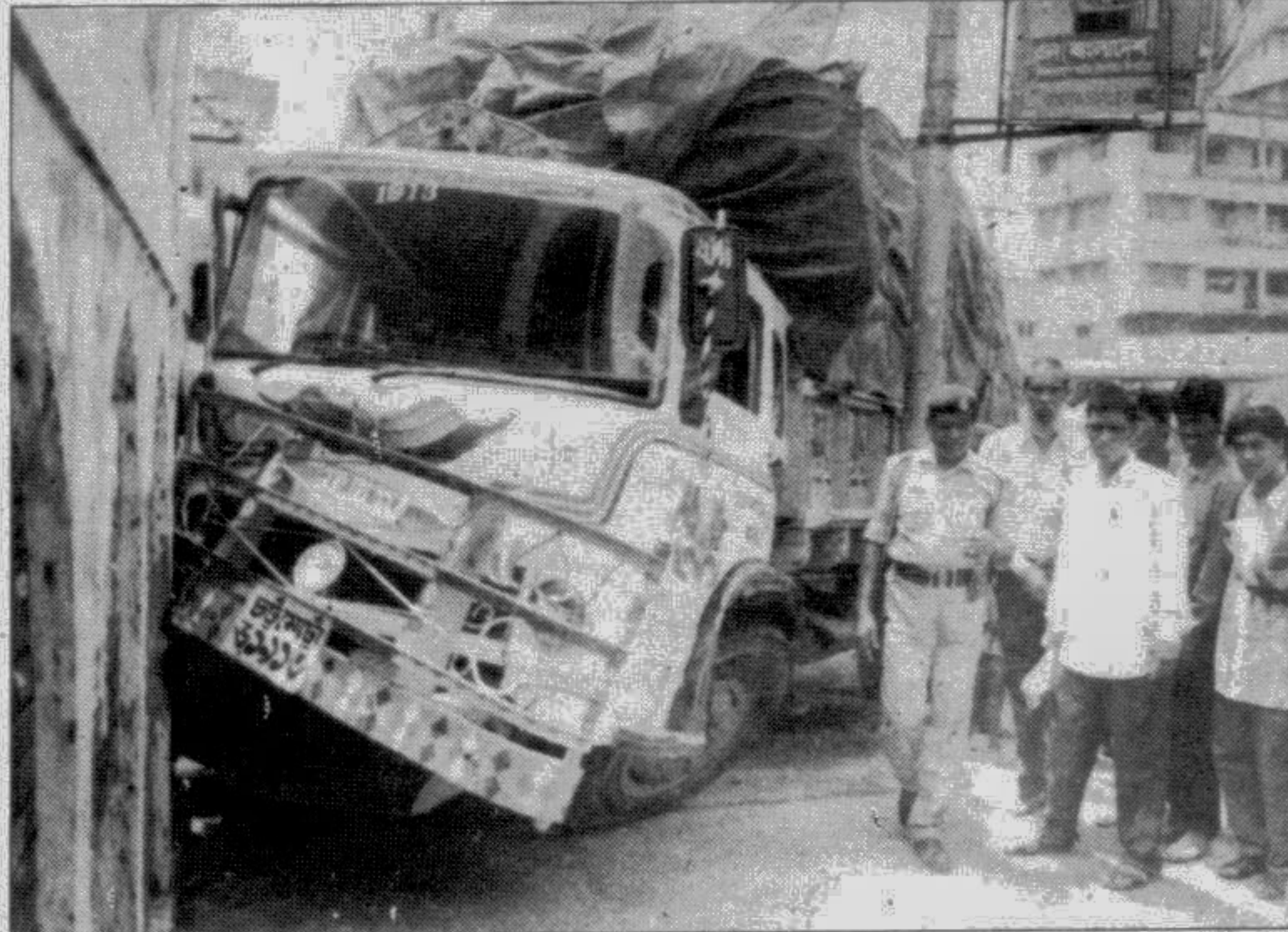
A loaded truck lost control and rammied a wall at the Dainik Bangla crossing near Motijheel in the city yesterday.

However, he said Islamabad would support any step that would lead to the recognition of the Palestinians rights and would extend support to any arrangement that reduces the suffering of the Palestinian people.