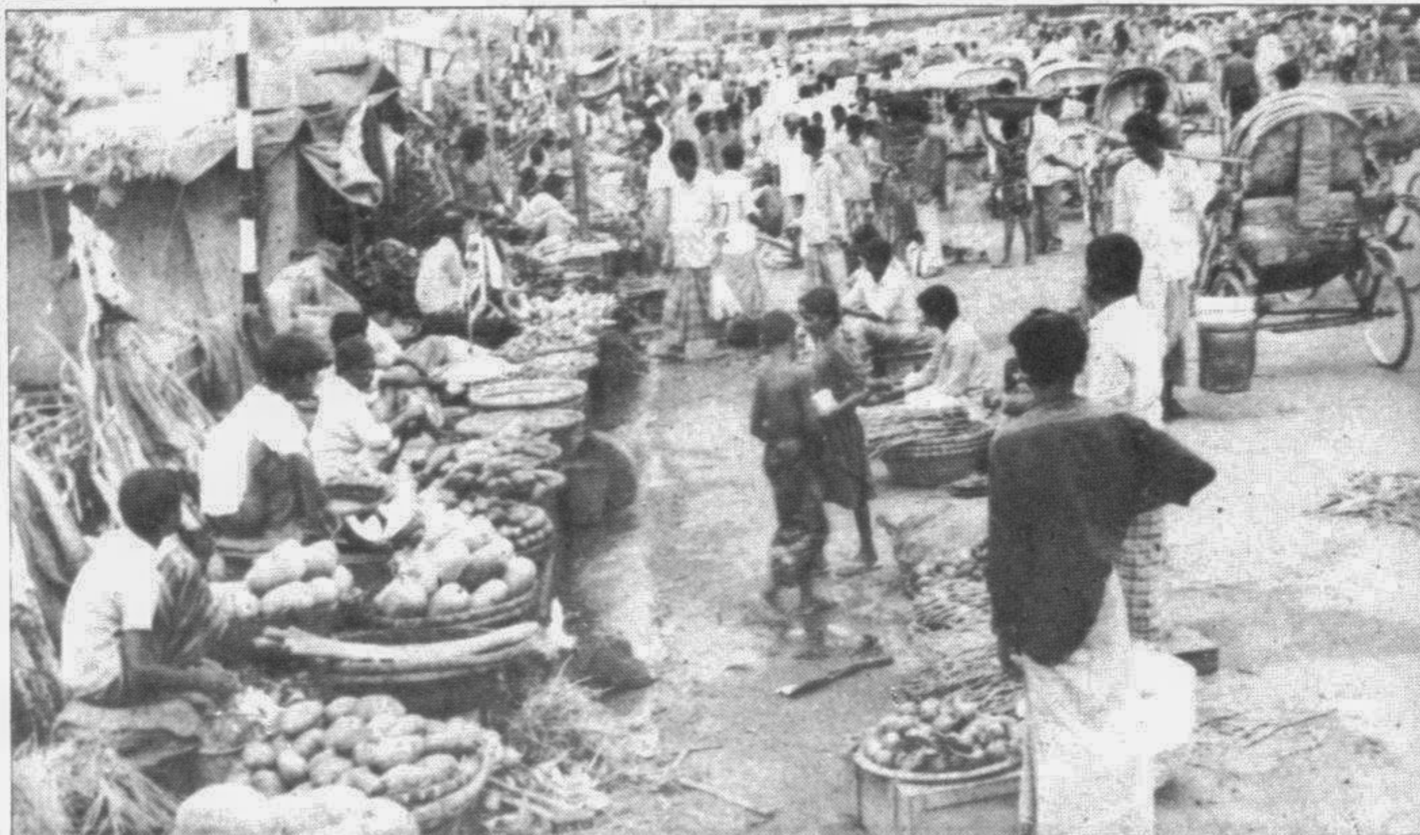
In spite of the eviction drive by the Dhaka City Corporation and police against street hawkers a large number of vendors carry on with impunity on the Bishwa Road near Malibagh Bazar.