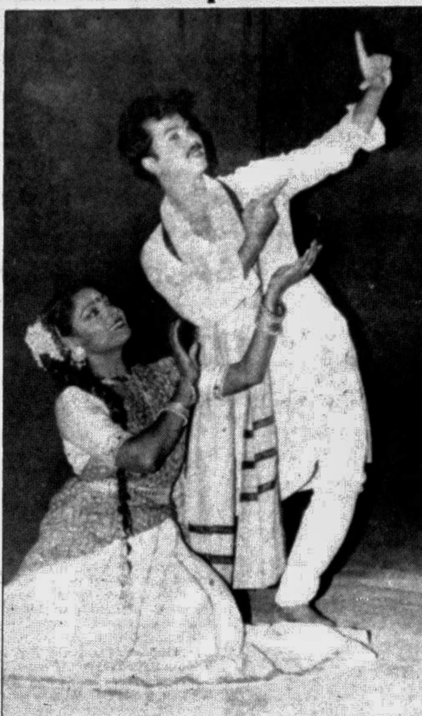
A sequence of dance at the Business and Professional Women's Club auditorium in the city yesterday.