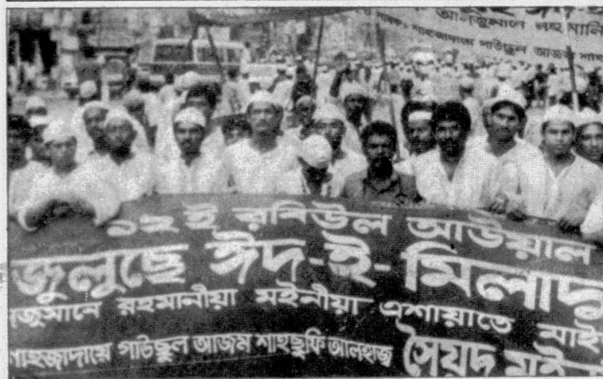
A procession on Eid-e-Miladunnabi in the city yesterday.

Three local bullies forcibly entered the house of an old woman at Kathalagan in the city yesterday and sped away taking ornaments.