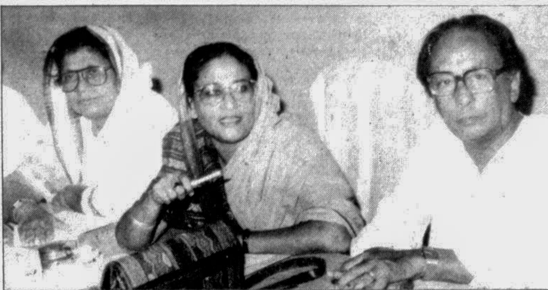
AL chief Sheikh Hasina addressing a meeting of Council of Advisors of her party at the Bangabandhu Avenue central office yesterday.

Trade relations is normally an important aspect of diplomacy and it is no different in this case. According to Guldere, the total value of trade between the two countries is US$20 million per annum — mostly in Bangladesh's favour. He feels that "this certainly does not reflect the full potential" and suggests that "if joint chambers of commerce could be established in Dhaka, even a modest secretariat would be able to disseminate more information and make appointments for bilateral visits for businessmen from both countries to explore further possibilities for trade to flourish."