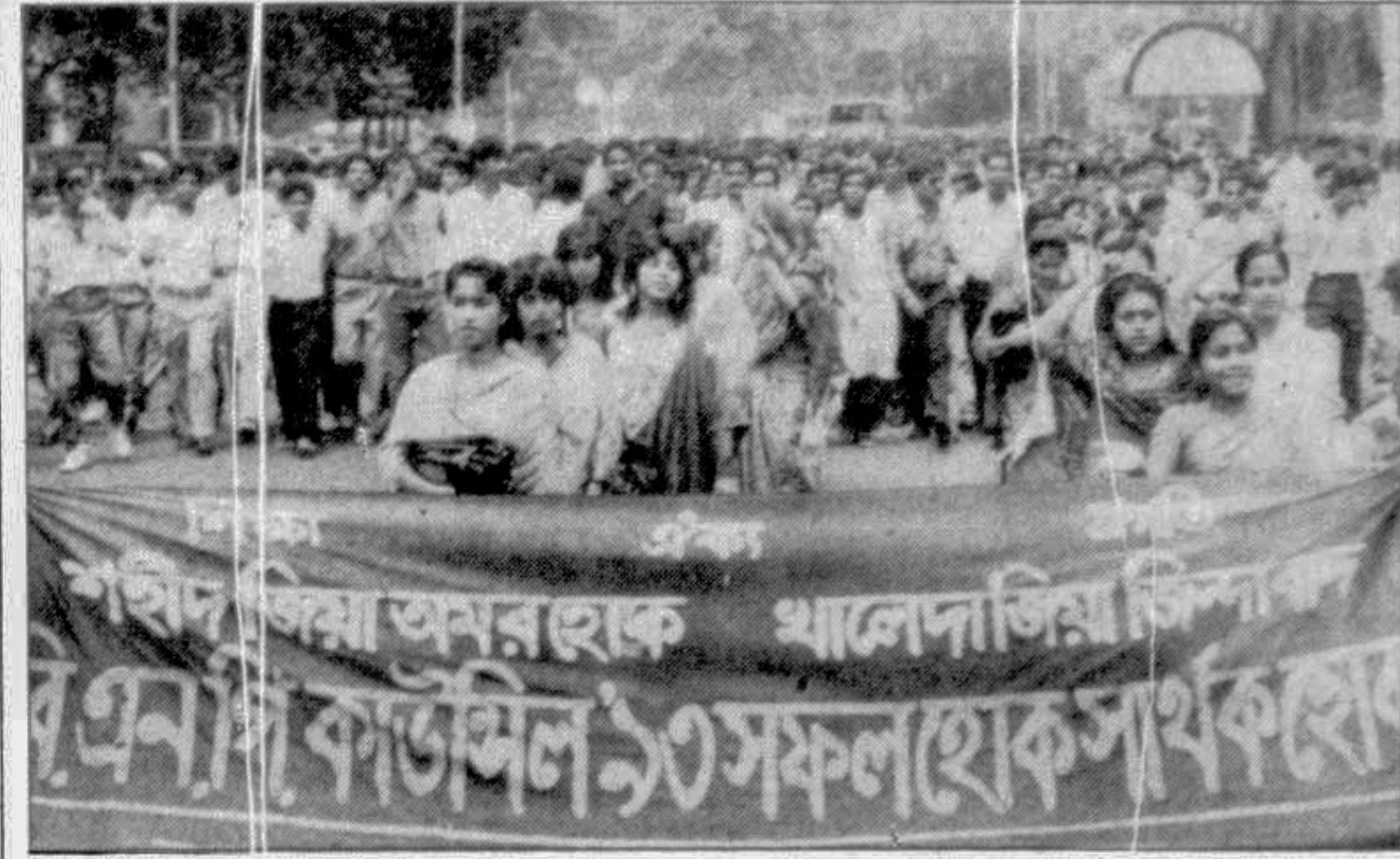
JCD brought out a procession in the city yesterday to make the BNP's council session a success.