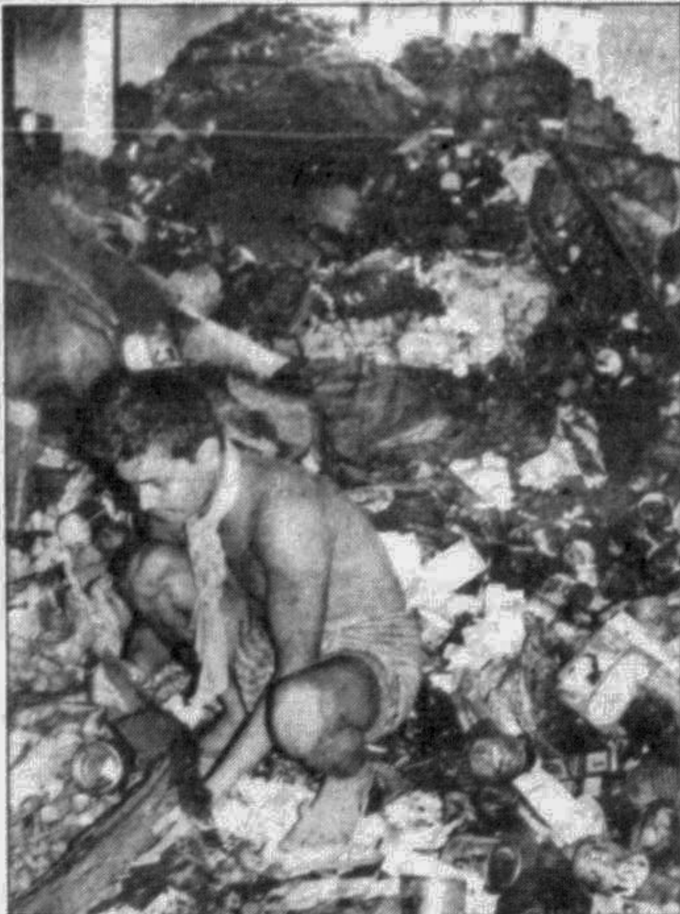
The godown of Pabna Homeo Research at Swamibagh was badly damaged by fire yesterday.

It is the 15th batch of family planning workers and officials to be trained under Indonesia-Bangladesh bilateral programme organised by Family Planning Management Development (FPMDD).