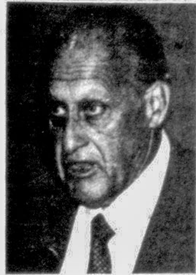
JOAO HAVELANGE strengthened by the development of its new 20 billion pound (13 billion dollars) pro-

He explained that while Europe's common market was made up of just 12 countries, there were another 25 countries that did not have enough economic power to belong to the elite. Football responds to the same demands.