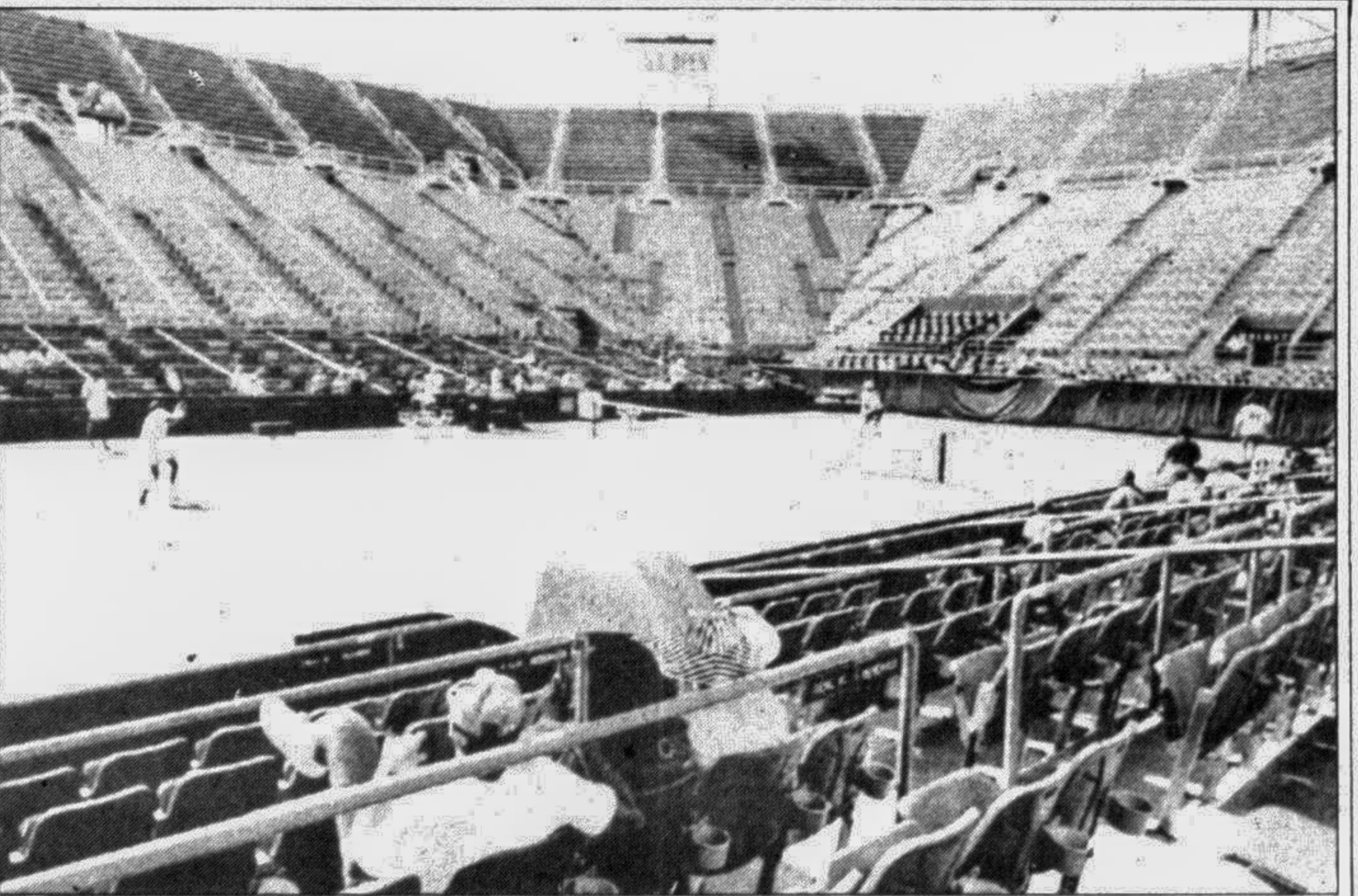
Three of ardent Boris Becker fans try to stay cool under an umbrella while watching the German (far end of the court) practice on August 26 at the National Tennis Centre. Temperature reached nearly 100 degrees at the courtside players prepare for the US Open, which begins from Monday at the Flushing Meadow.