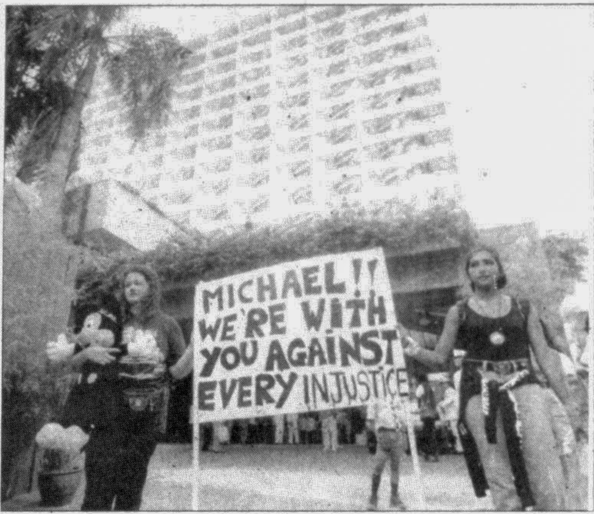
Female fans of Michael Jackson displaying a banner supporting the pop idol in front of his Bangkok hotel yesterday. Jackson is battling an allegation that he sexually molested a 13-year-old boy. Jackson also cancelled his concert yesterday for the second time due to illness. (Story on Page 5)

Earlier, the Chhatra League workers, carrying torches, paraded through the town's main road from the Government Tolaram College, where they held a rally in the morning. The rally was organised to protest what they called the alleged terrorism by the ruling party's front organisations and police inaction in this regard.