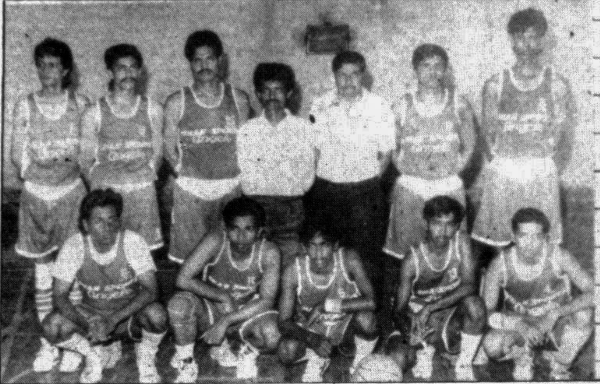
Players and officials of Angels Club who won the Purabi General Insurance 6th Federation Cup basketball tournament beating Eagles Club in the final at the wooden floor gym yesterday.

The six-team competition began on August 20. Six teams — Angels, Eagles, Khulna Abahani, Jessore Customs Club, Rajshahi Reshampaty Boys' Club and Barisal Cadet