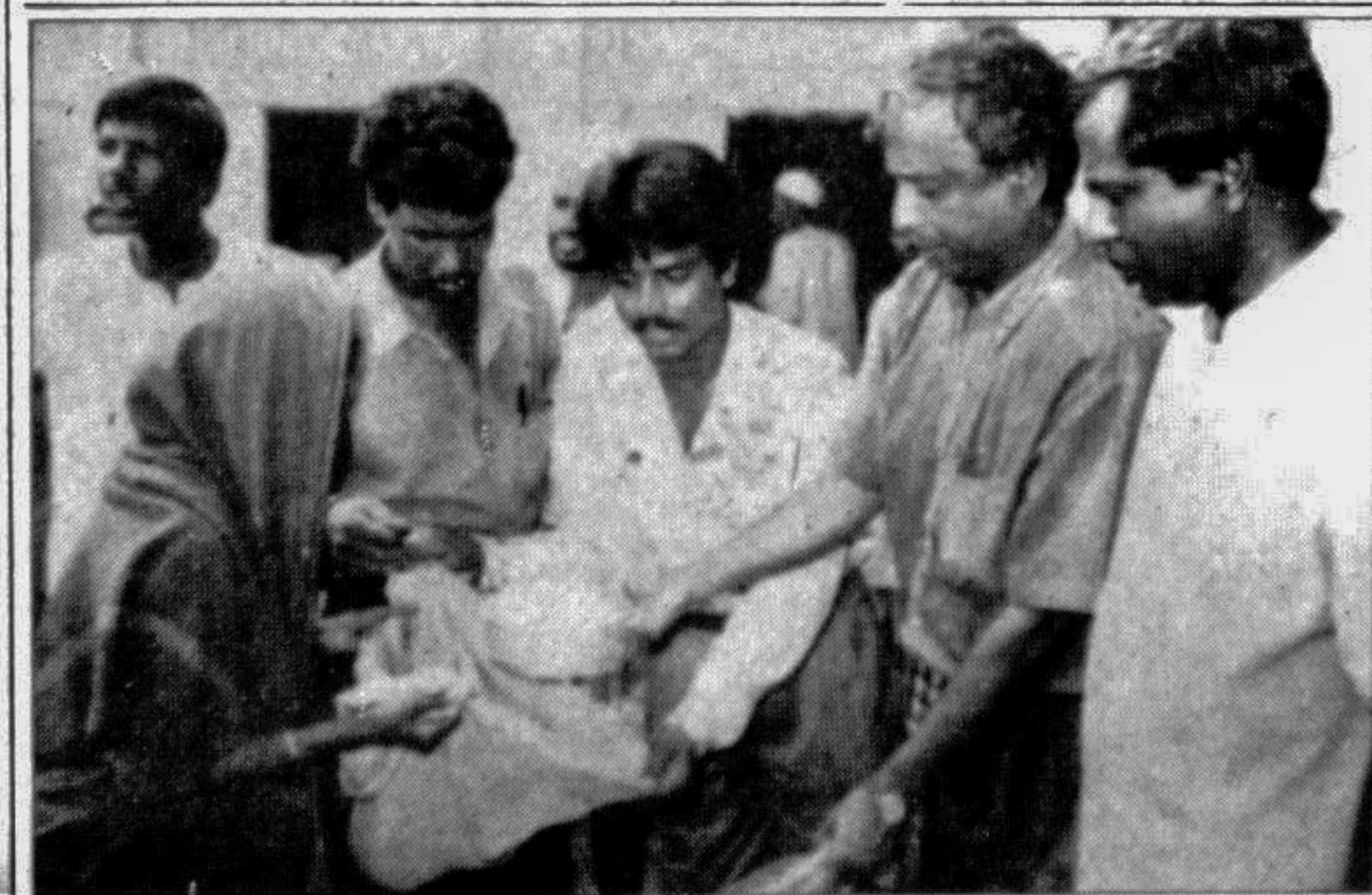
SYLHET: The staff of the local unit of Red Crescent Society are distributing relief materials among the flood victims of Satpur area of the district recently.

It is reported that there were about 2,000 unauthorised electric lines in seven thanas and municipality. A section of PDB men are involved in such illegal activity. On the other hand, a number of electricity consumers complained that they are not getting their electricity bills regularly and often metre readings show abnormal high figures.