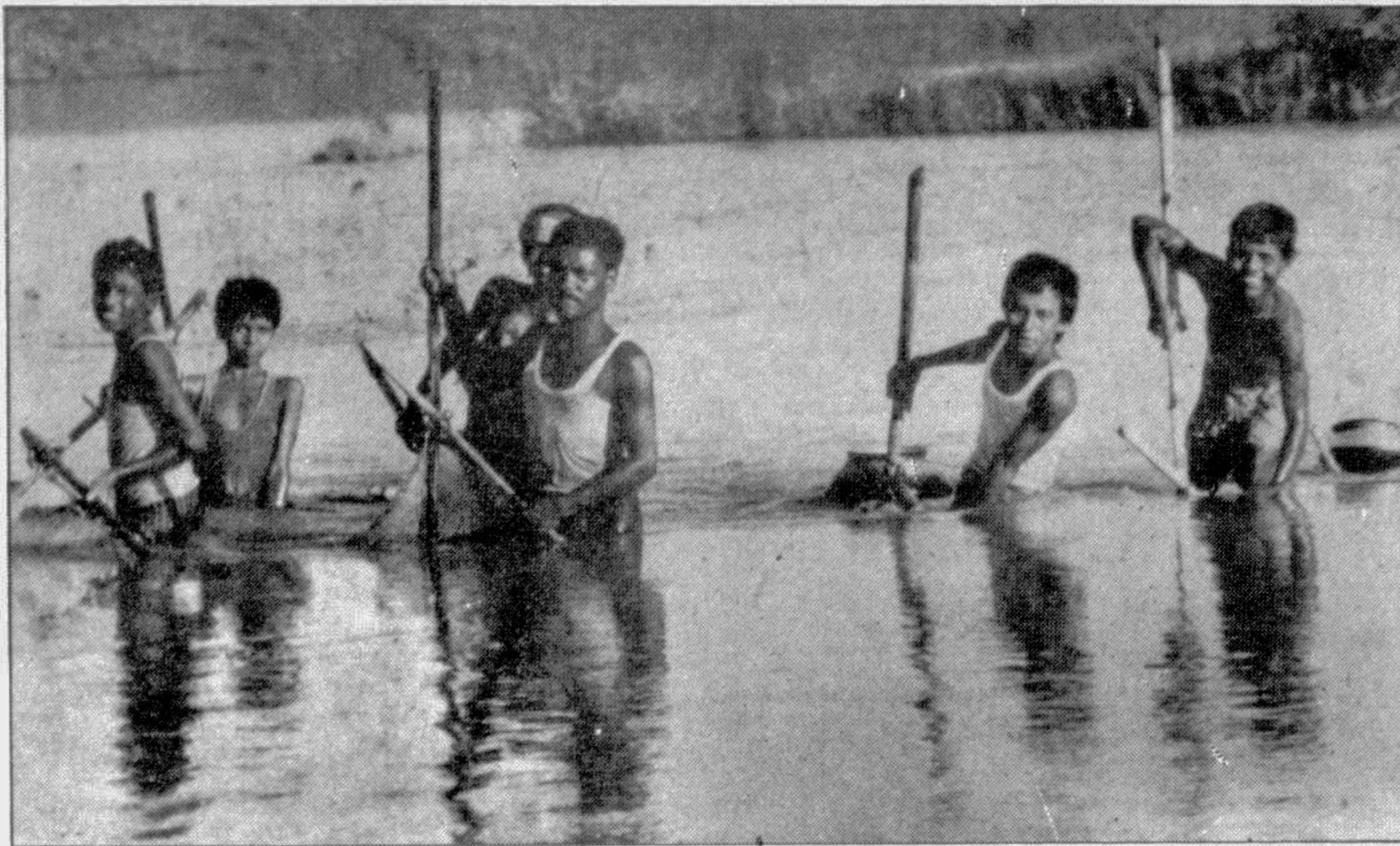
FISHING DURING RAINY SEASON: A group of villagers is fishing in a field so that maximum number can be caught

The injured were admitted to local hospital. Police arrested a man with a gun. A case has been filed with the local police.