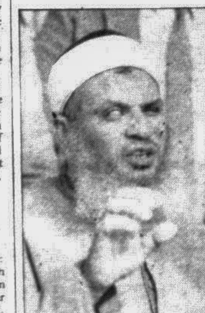
Omar Abdel-Rahman, the blind Egyptian Islamic fundamentalist leader.

NEW YORK, Aug 26: A radical Muslim cleric was the guiding hand behind a terrorist organisation that bombed the World Trade Center, plotted to blow up other New York landmarks and planned a host of other violent acts, prosecutors say, reports AP.