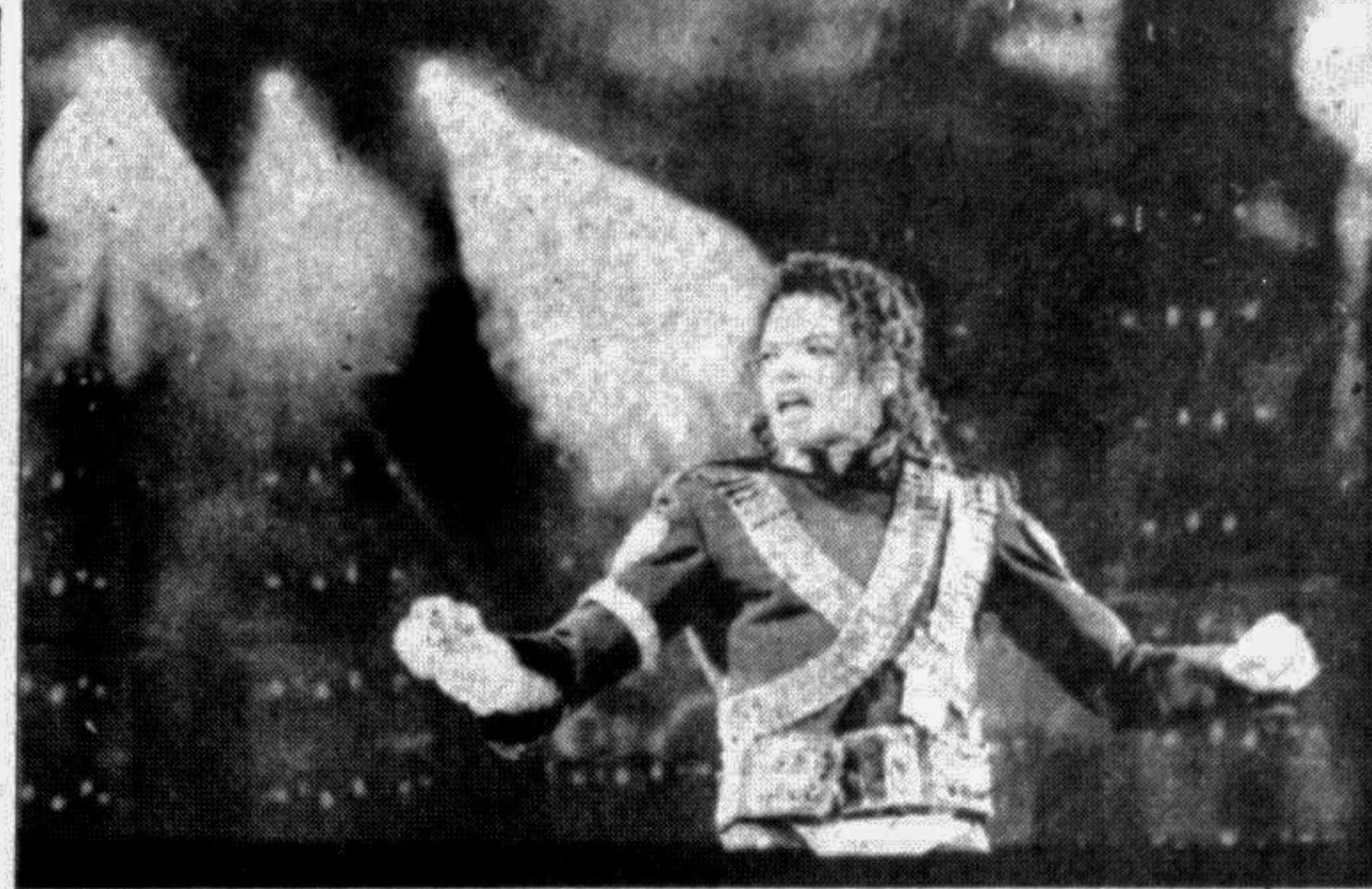
Michael Jackson performs during the opening concert of the Asian leg of his 'Dangerous' world tour in National Stadium in Bangkok on Monday. Jackson performs two concerts here on Monday and Tuesday.