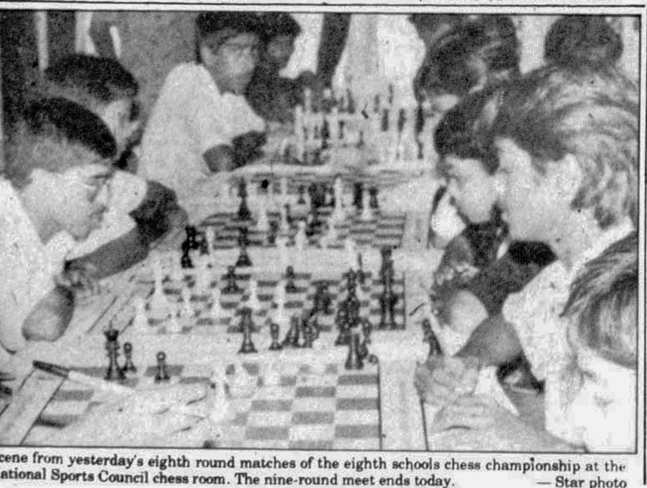
Scene from yesterday's eighth round matches of the eighth schools chess championship at the National Sports Council chess room. The nine-round meet ends today.

Among the violations found by the Pac-10 were improper loans to athletes, free meals provided to recruits and improper employment of athletes by boosters. The conference also cited a lack of institutional control over funds provided to students hosting recruits.