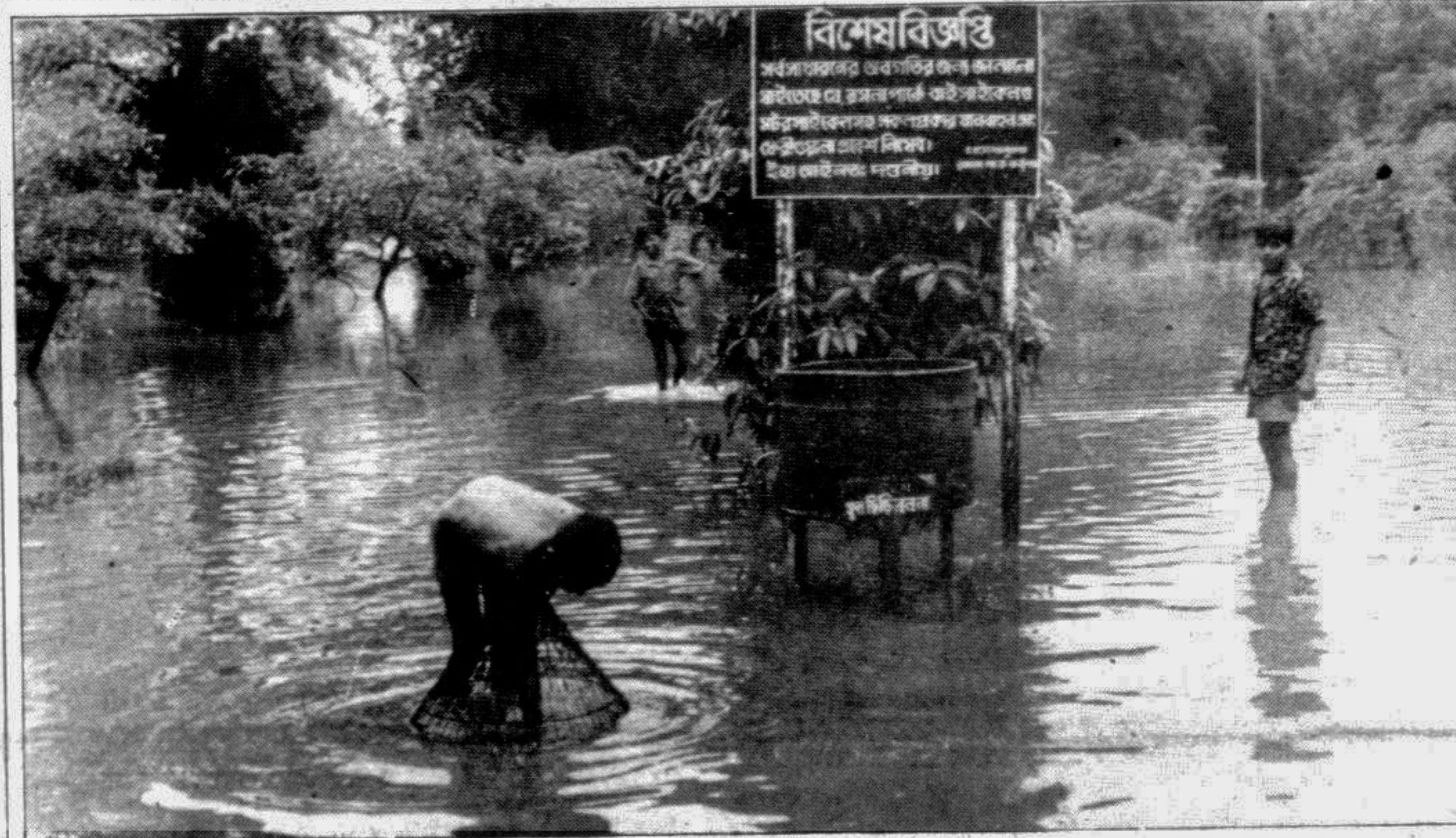
TURNING ADVERSITY INTO ADVANTAGE: While rest of the capital languished under the wretchedly wet weather of the past few days this little fellow wasn't to be denied his day's 'catch.' The picture was taken yesterday at the city's Ramna Park where the man-made lake has spilled its banks and flooded the lush green lawns.

MANAMA, Aug 24: The Saudi market reacted sharply today to a report published in the United States that Saudi Arabia has run down its financial reserves because of years of unrestrained spending. Dealers in the kingdom said people were selling riyals for dollars in hectic trading in the Saudi Riyal Interbank Market. "The market has reacted sharply to the New York Times report. It (the market) is very confusing. It's really very hectic trading," one dealer in Riyadh told Reuters. Trading on the Saudi Riyal Interbank Market is usually quiet and focuses on trading dollars for Riyals. The New York Times said the kingdom has run down its financial reserves because of years of unrestrained spending, huge military purchases and