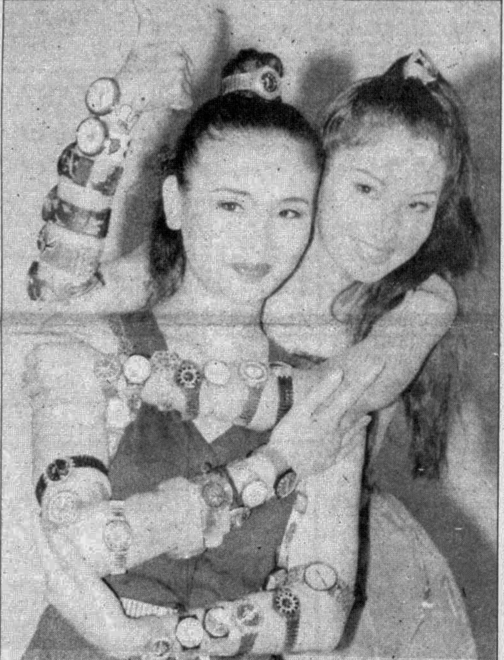
Chinese models pose with Swatch watches during the launching of the trendy Swiss-made quartz watches yesterday in Beijing. The Swatch regional director for the Far East hopes that China will be their number-one market in the world in three years.

war, he said Japan had become "one of the prime beneficiaries" of world prosperity and peace. "Yet we should never forget that this achievement rests upon the supreme sacrifices made during the war and is the result of great efforts made by previous generations," he said. "It is important at this juncture that we state clearly before all the world our remorse at our past history." "I would thus like to take this opportunity to express a new our profound remorse and apologies for the fact that past Japanese actions, including aggression and colonial rule, caused unbearable suffering and sorrow for so many people and to state that we will demonstrate our new determination by contributing more than ever to world peace," he said.