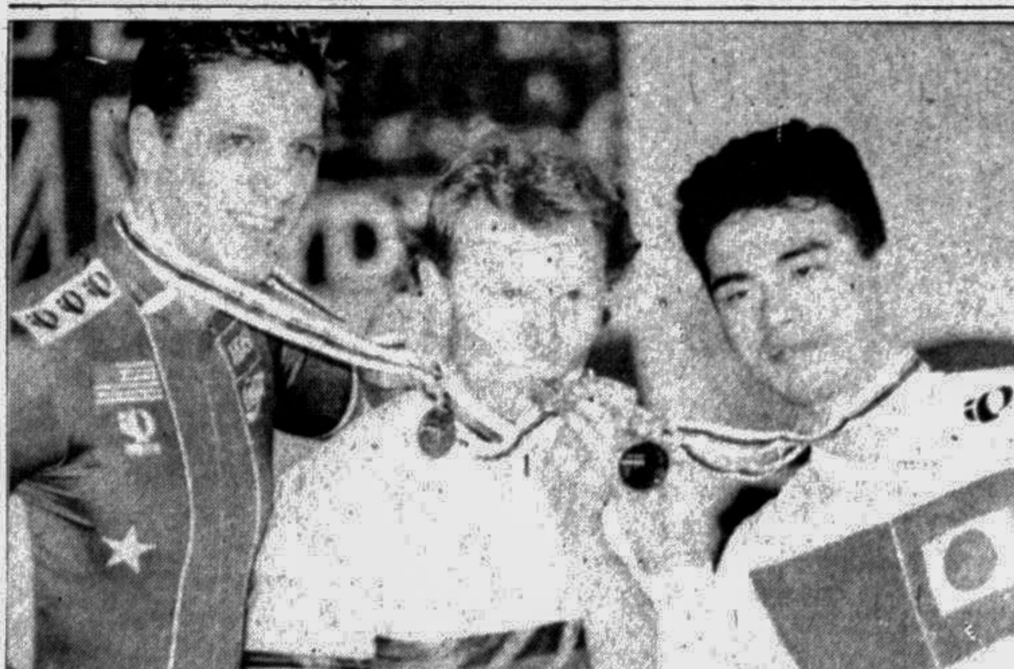
Marty Nothstein of the United States, Australian Gary Neiwand and Japanese Toshimasa Yoshioka (from L to R) show their medals after winning the Kenin final at the World Cycling Championships in Hamar, Norway on August 21. Neiwand won the gold, Nothstein silver and Yoshioka the bronze.

The crowd at the National Tennis Centre in Toronto gave both players a standing ovation at the end of the first-set tiebreak in recognition of their good play.