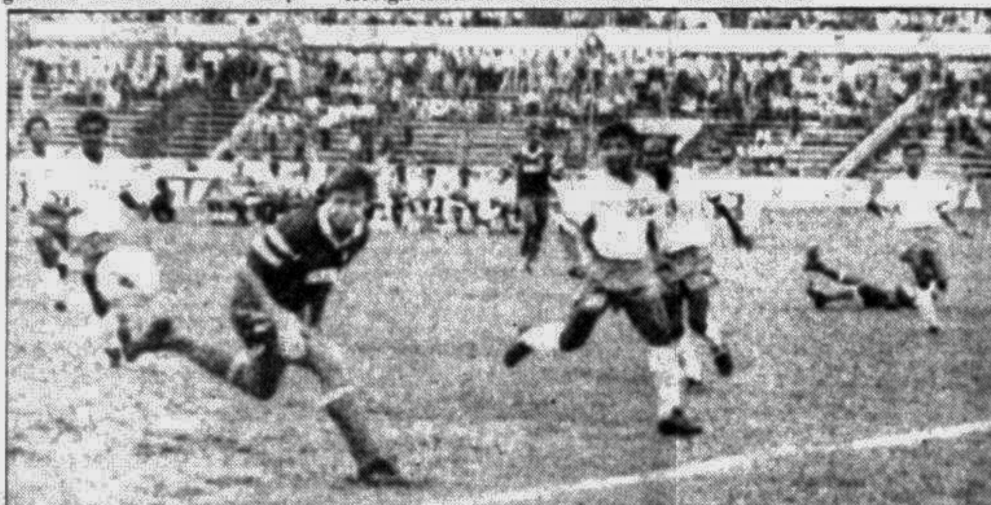
Action from yesterday's Asian Cup Winners' Cup second round match between Mohammedan Sporting Club and Radiant Club of Maldives at the Dhaka Stadium. Mohammedans mauled the Maldives club side 8-0.