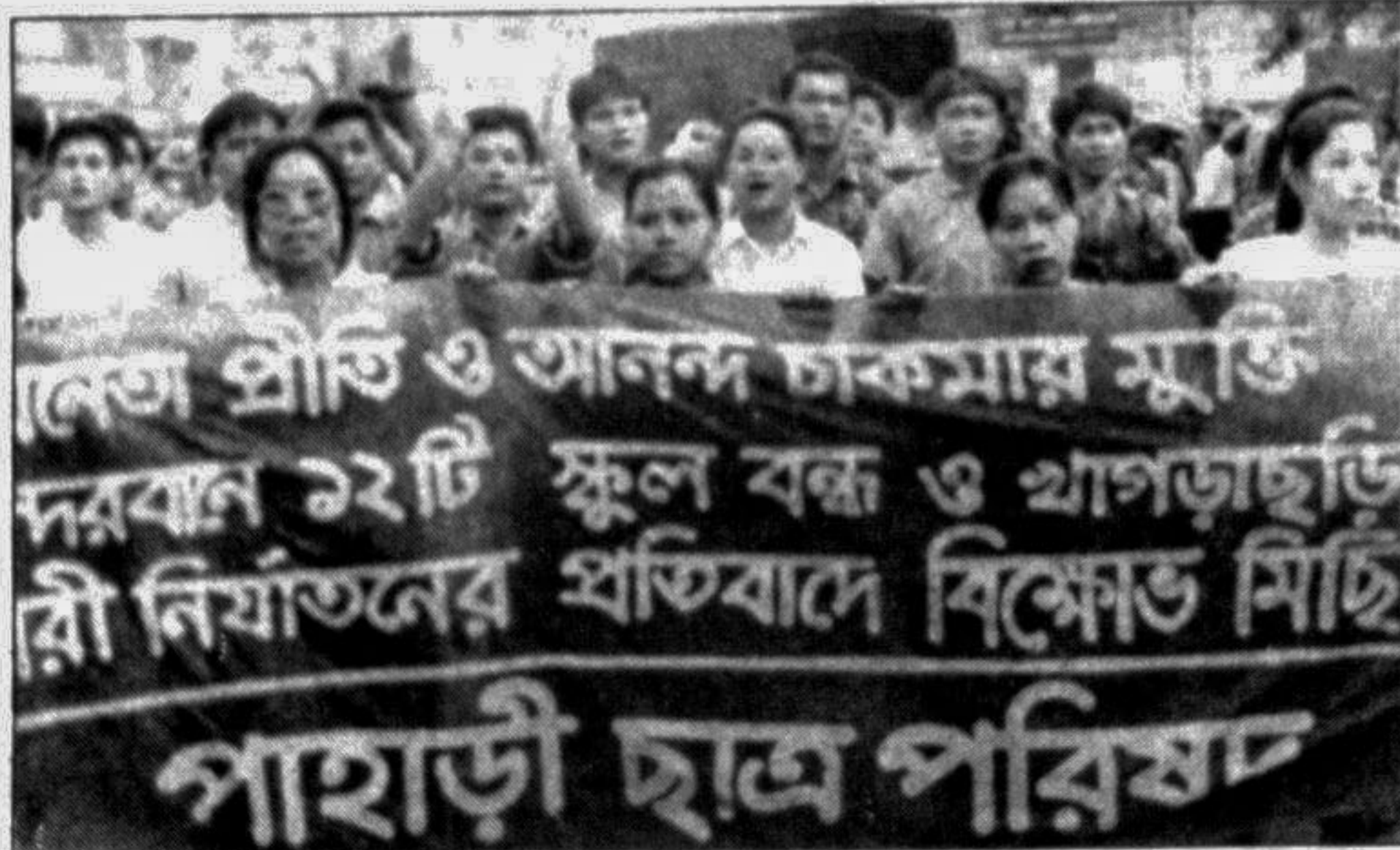
Procession of the Pahari Chhatra Parishad (Hill Tracts Students' Council) in the city yesterday demanding release of two of their activists.

An emergency meeting of the Bangladesh Sangbadpatri Parishad (BSP) Executive Committee will be held on Aug 25 at 11 am at Ajker Kagoj office at Dhanmondi, reports UNB. Police rounded up 69 people from different parts of the city in last 24 hours on various charges, a DMP press release said Sunday, reports UNB.