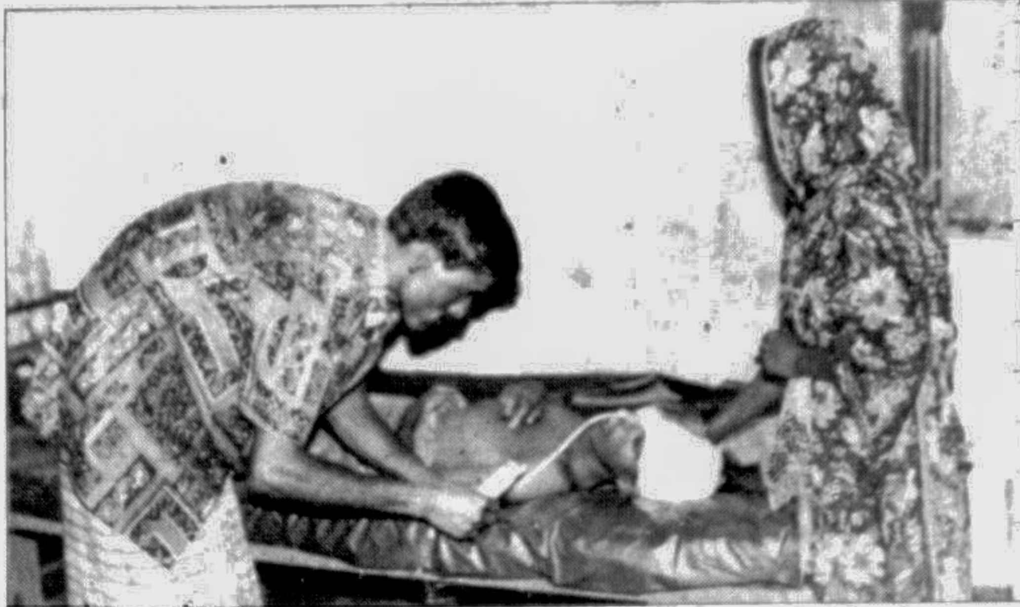
Relatives attending a patient at the Dhaka Medical College Hospital while the nurses continued their strike for the fourth successive day yesterday.

On Wednesday, the government pounded the strategic Khmer Rouge base of Phum Chat in the northwestern province of Banteay Meanchey. By Friday the government's flag was flying in what had been considered the guerrillas group's second headquarters.