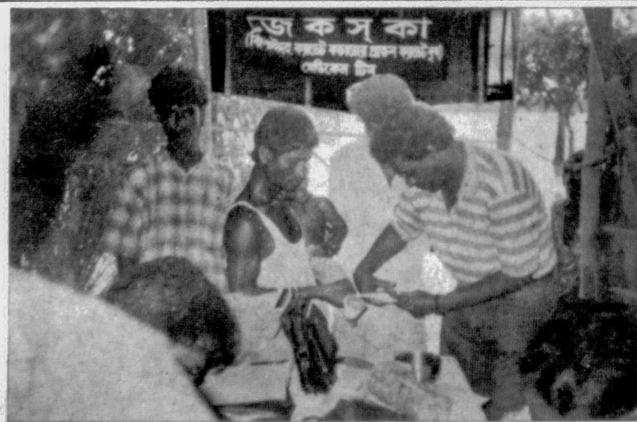
The JEXCA (association of the ex-cadets of Jhenidah Cadet College) medical team rendering services to the flood victims of Maulvibazar.

It may be mentioned that 2,365 kgs of shrimp had been produced in an acre through semi intensive shrimp cultivation in Khulna area this year.