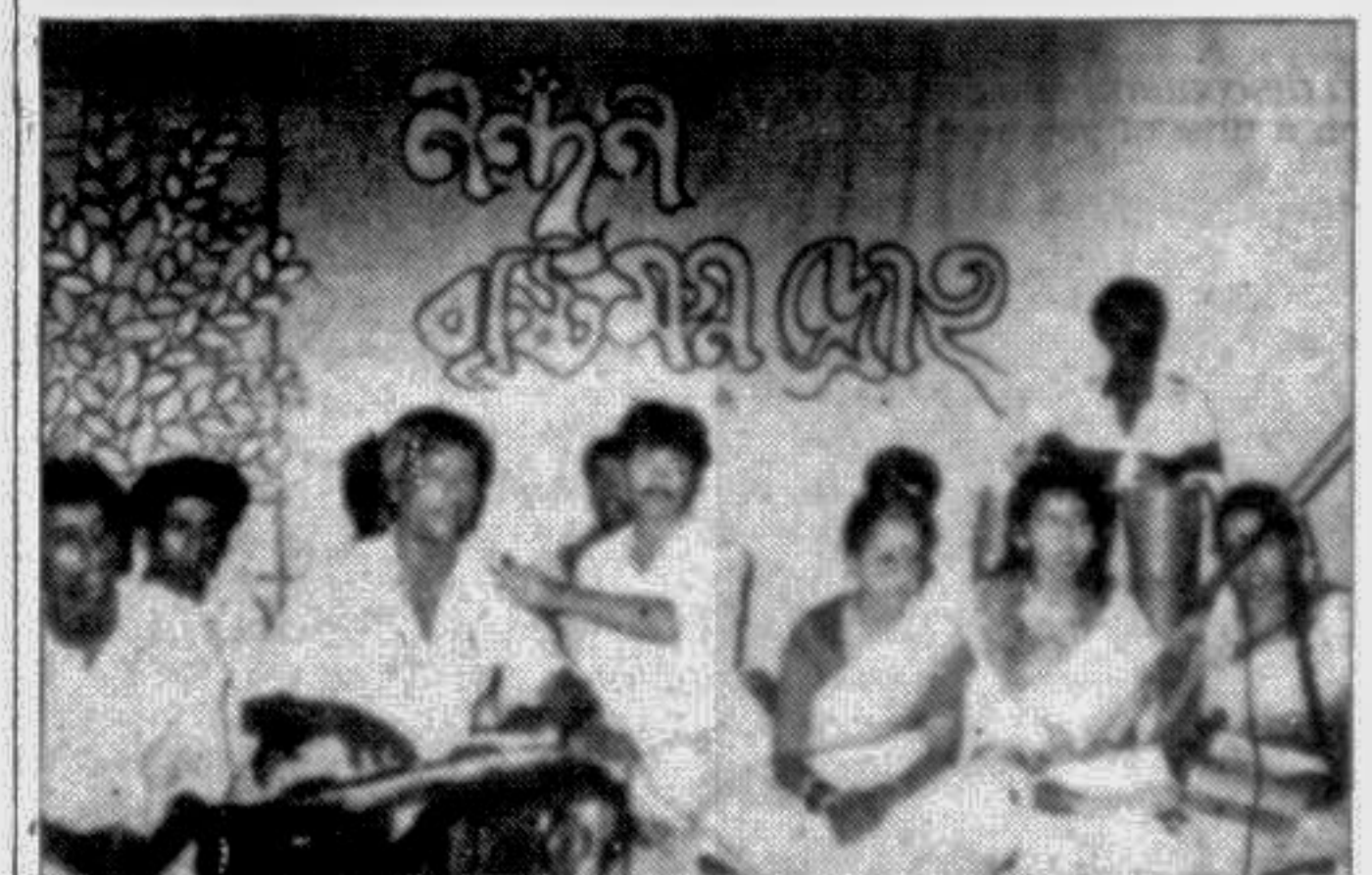
GOPALGANJ: The artistes of local Nandan Shahitya Sanskritik Sangstha rendering songs on the occasion of 'Sraboni Baran Festival' held at the local public hall recently.

Besides, the local varieties of paddy are more nutritious than IRRI-Boro, local experts said.