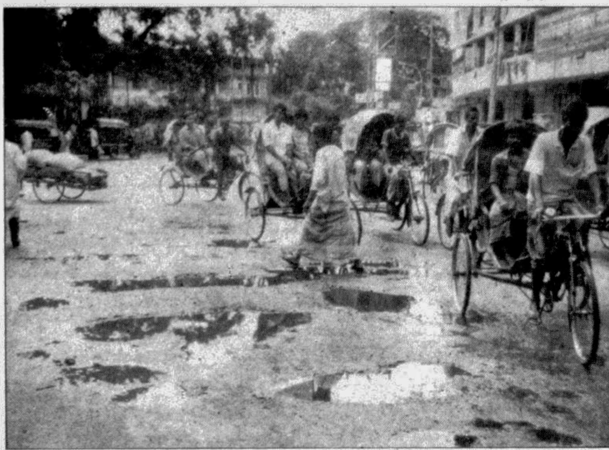
SYLHET: Potholes have been developed on the road at the town near the court point causing sufferings to the pedestrians and damaging vehicles.

The driver was arrested and handed over to Kotwali police.