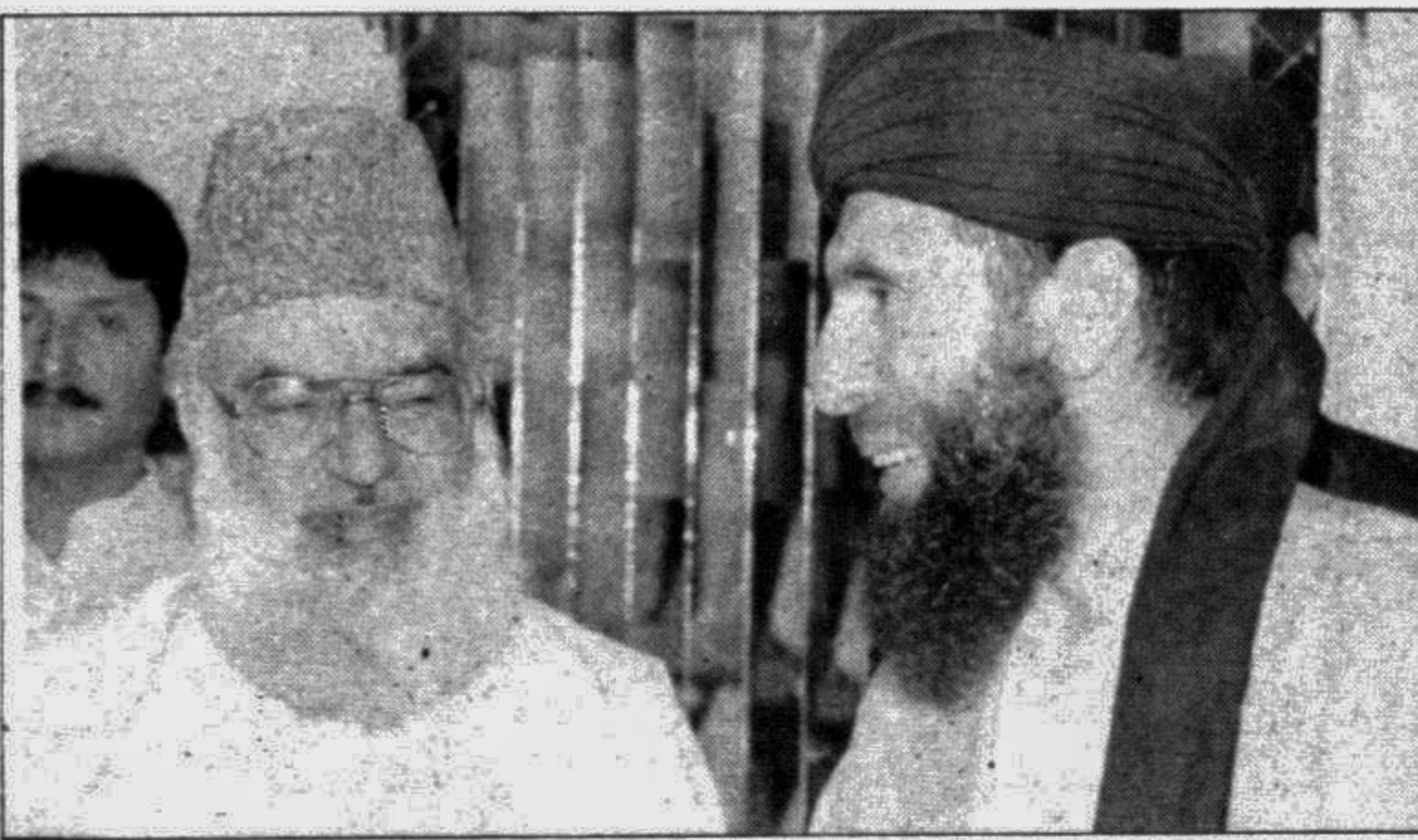
ISLAMABAD: Afghanistan Premier Gulbuddin Hekmatyar (R) chats with Qazi Hussain Ahmad (L), chief of the fundamentalist Jamaat-i-Islami Party, August 17 at a dinner party hosted by Qazi Hussain in Hekmatyar's honour. Qazi's party played a vital role in the battle against the forces of the former Soviet Union in Afghanistan.

Indonesian accidents claim 47: Four separate road accidents claimed the lives of 47 people and injured more than 150 in the Indonesian provinces of Sulawesi and east and central Java, news reports said in Jakarta yesterday, according to AFP. The official Antara news agency yesterday reported that at least 31 people were killed and 27 others injured when a bus plunged into a 24 meter (79.2 feet) ravine Tuesday in Sawo district near the East Java town of Ponorogo. The Daily Suara Merdeka said two other road accidents on Monday in Batang Regency, central Java killed 12 people and injured 80 others. The newspaper said six people were killed and 24 injured when a truck hit a bus carrying 30 passengers, and another six were killed and scores injured when two buses collided.