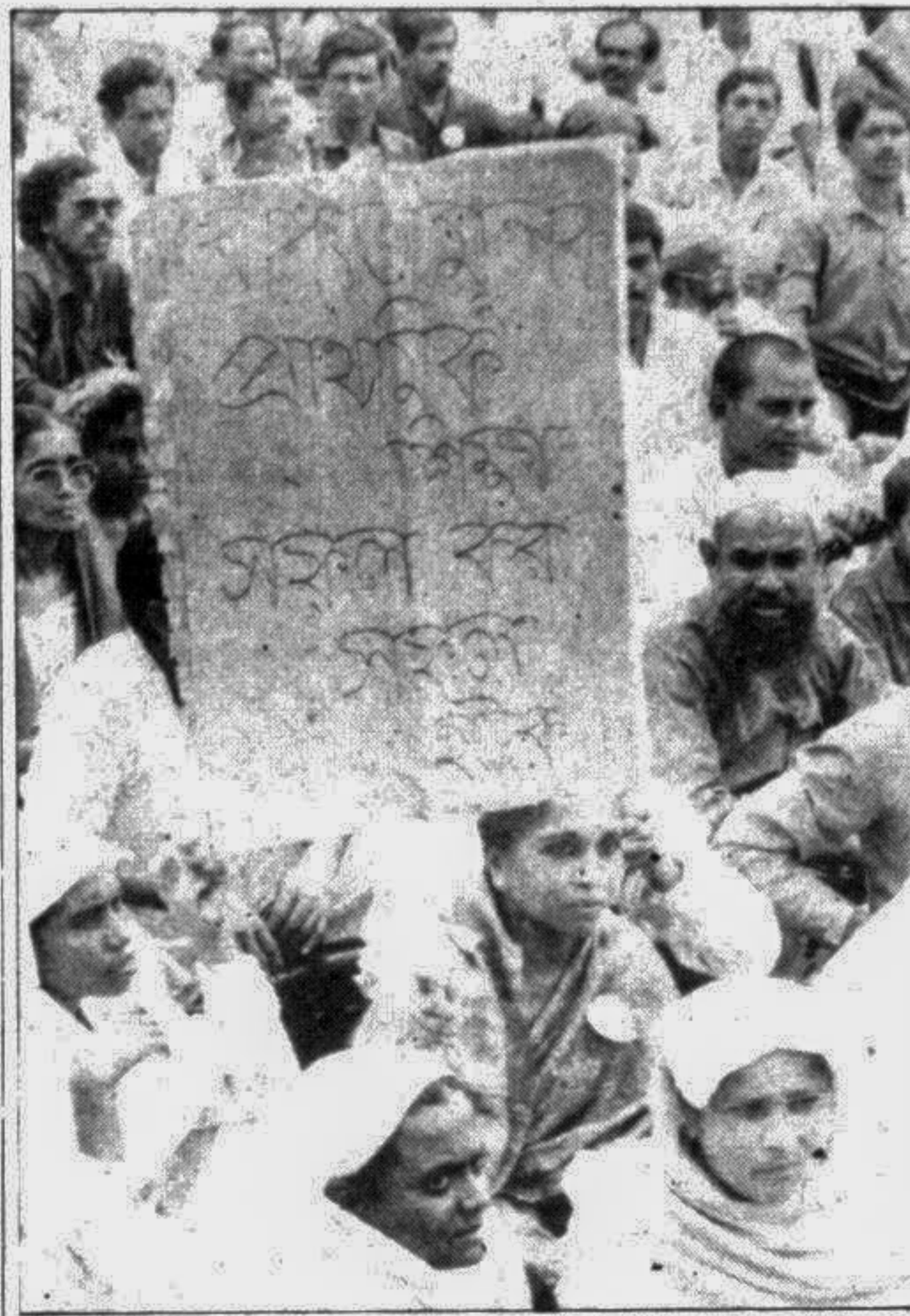
Primary Teachers' Association held a rally demanding sanction of house building loan in front of Jatiya Press Club yesterday.