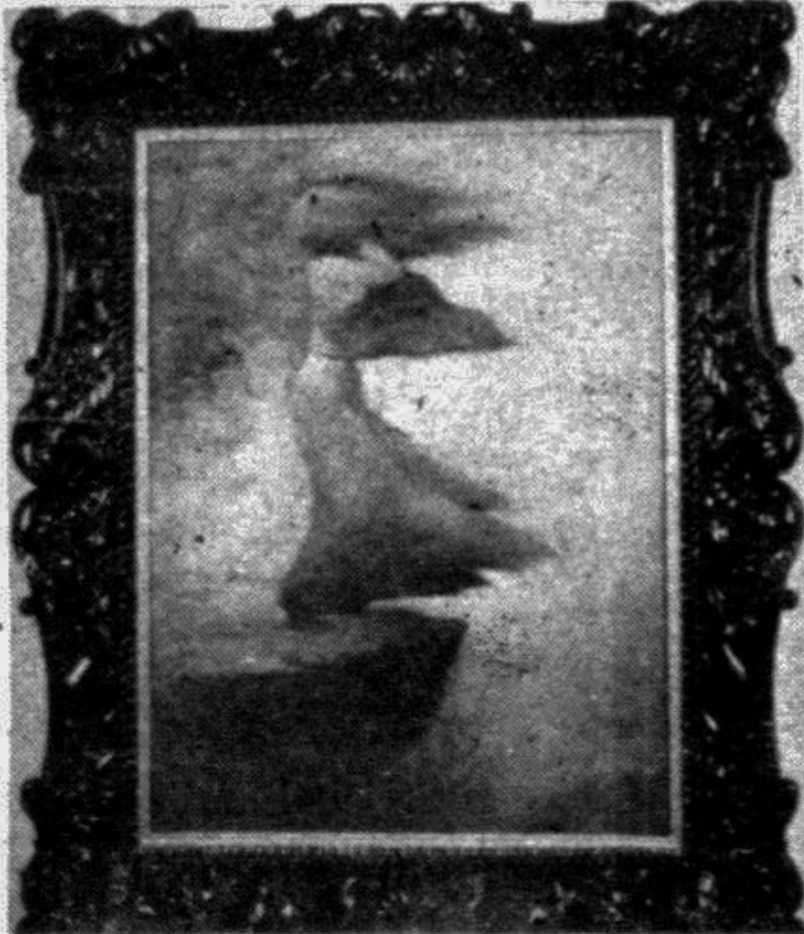
'The Last Judgement of Denial'