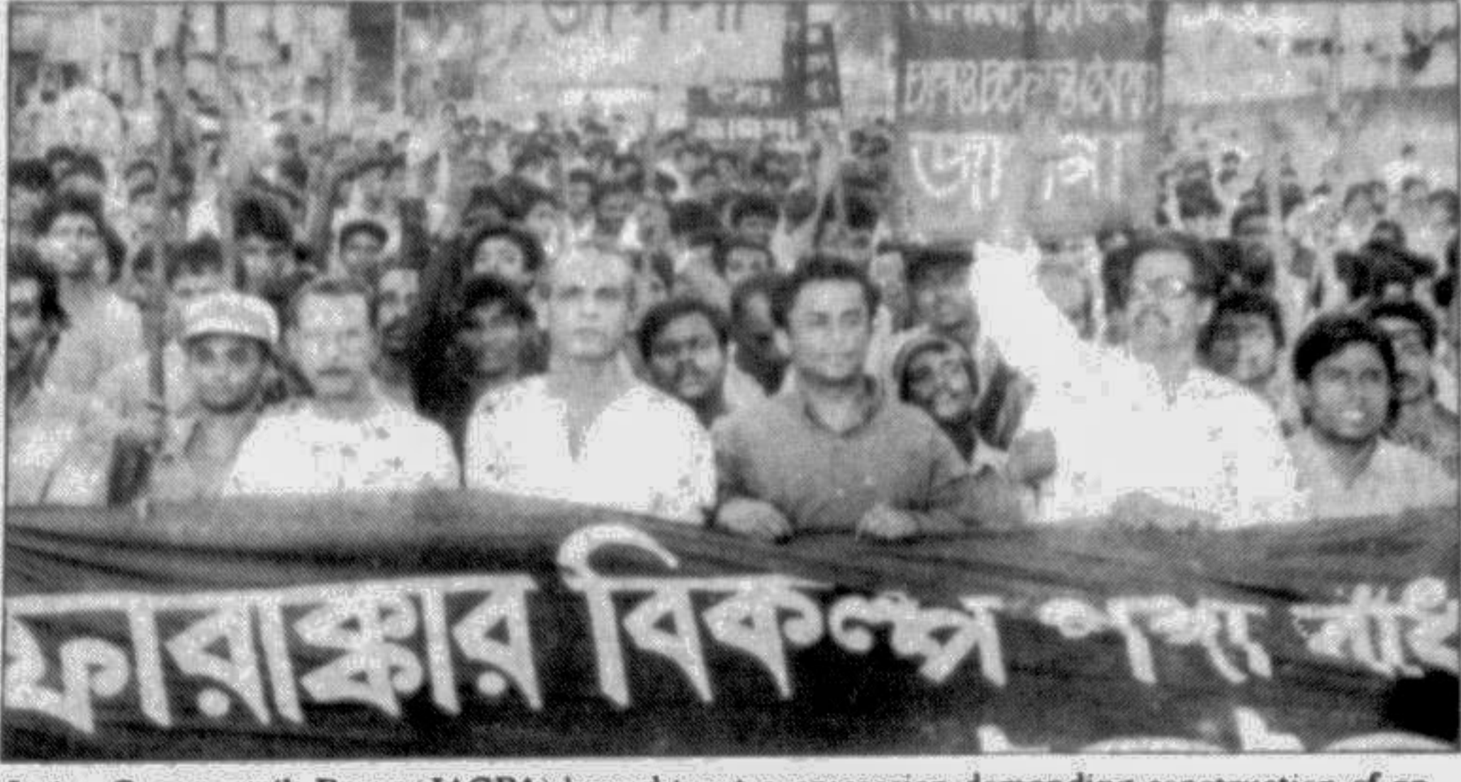
Jatiya Ganatantrik Party (JAGPA) brought out a procession demanding construction of an alternative barrage of Farakka in the city yesterday.